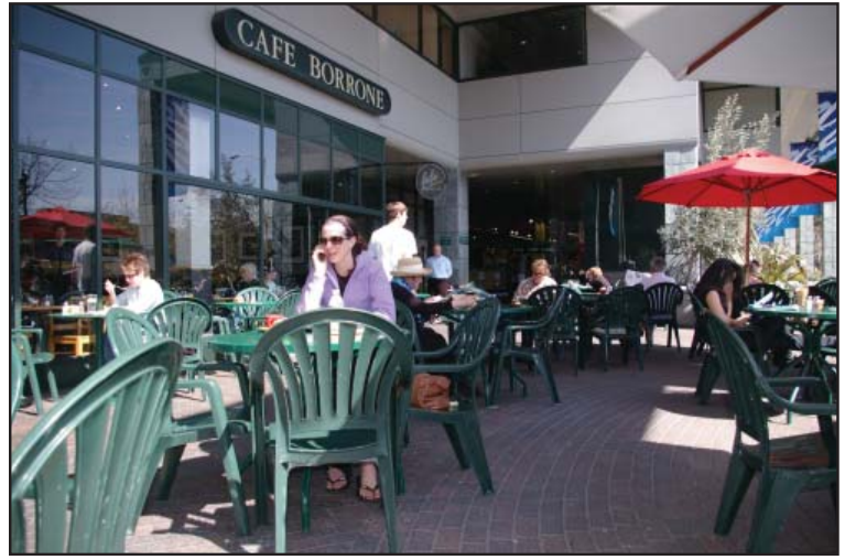
Customers grab a bite to eat and enjoy the sun at Café Borrone in downtown Menlo Park.

Riders can take Caltrain from San Francisco to San Jose to a number of destinations that are within a short walk of a station, such as the Menlo Center in downtown Menlo Park. Nestled along El Camino Real, just one block from the Menlo Park Caltrain Station, the Menlo Center