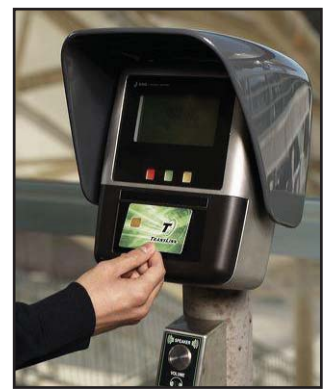
Caltrain employees are currently testing cards.

The TransLink card can be loaded with monthly or multi-ride passes as well as e-cash. Before boarding the train, TransLink users "tag on" at a Trans-