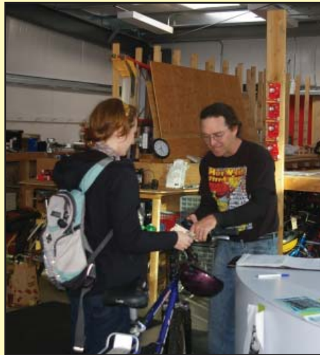
Warm Planet Bikes, located at the San Francisco Caltrain Station, offers valet bike parking.

Caltrain customers with disabilities may bring an Electric Personal Assistive Mobility Device, such as a Segway, on Caltrain if the device is used for mobility purposes. Caltrain has developed a policy that allows EPAMDs to be boarded on the train as long as the customer obtains a permit and follows instructions for boarding and stowing the device. To obtain a permit, customers may request an application by calling Caltrain at 650.508.6202.