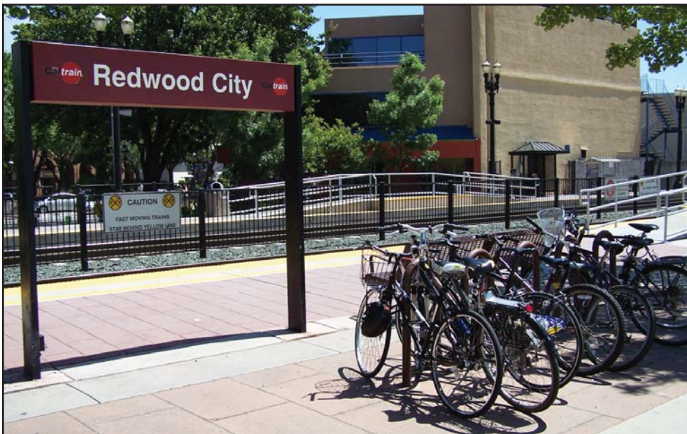
A grant would allow Caltrain to install e-lockers at the Redwood City station.

The Bombardier bike car capacity is increasing to 24, with retrofit expected to be completed by the end of July. For a list of trains that have the two bike cars, visit the Caltrain Web site at www.caltrain.com .