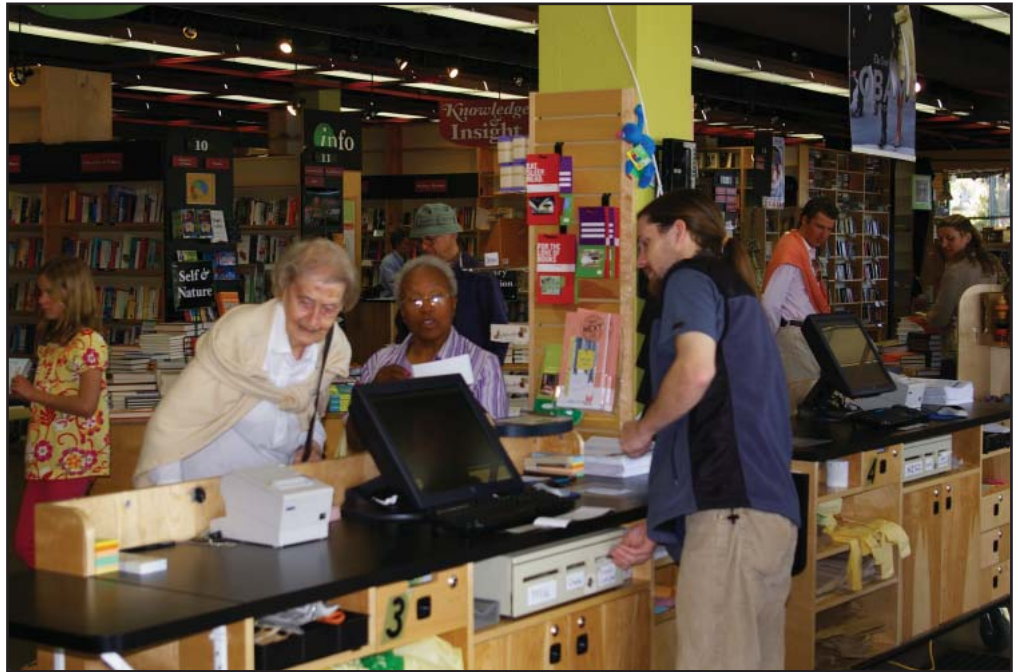
Customers have been buying books at Kepler's Books for more than five decades.