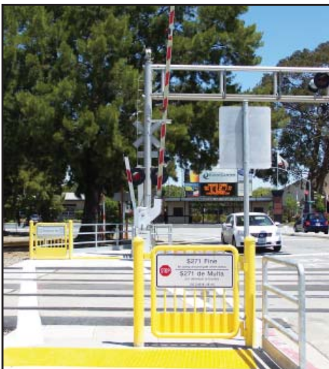
Grade crossing work at 25 th Avenue in San Mateo will be completed in late summer.

Work at 25 th Avenue in San Mateo will be completed by late August. Work will proceed to Redwood City, Atherton and Menlo Park. The remaining crossings in San Mateo and Burlingame will be completed later in 2009 and 2010. A similar project for crossings in Santa Clara County also is in the works.