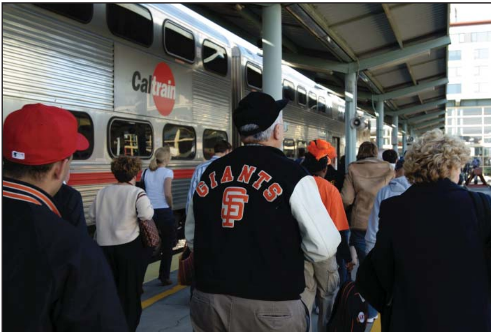
Giants fans head to AT&T Park from the San Francisco Caltrain Station at Fourth and King streets.

More than 25,000 TransLink transactions are being processed by AC Transit, Dumbarton Express and Golden Gate Transit every day. TransLink has been implemented and tested on BART and is expected to launch by early summer.