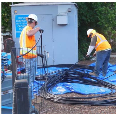
Preparing to install fiber