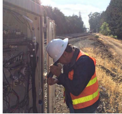
Confirming no dust or dirt on the fiber