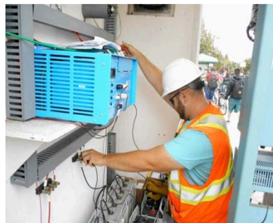
End of work ground verification test