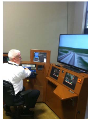
Simulator for training