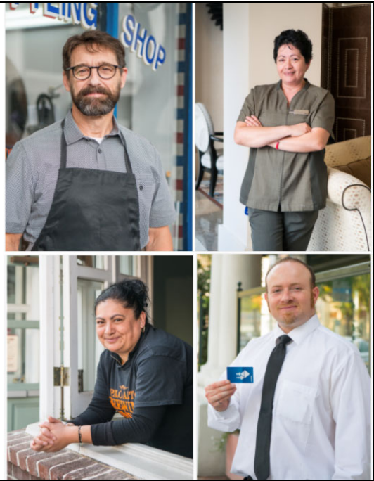
The program changes lives and improves hiring

For program participants, the median income is $31,200 while the mean income is $31,440: