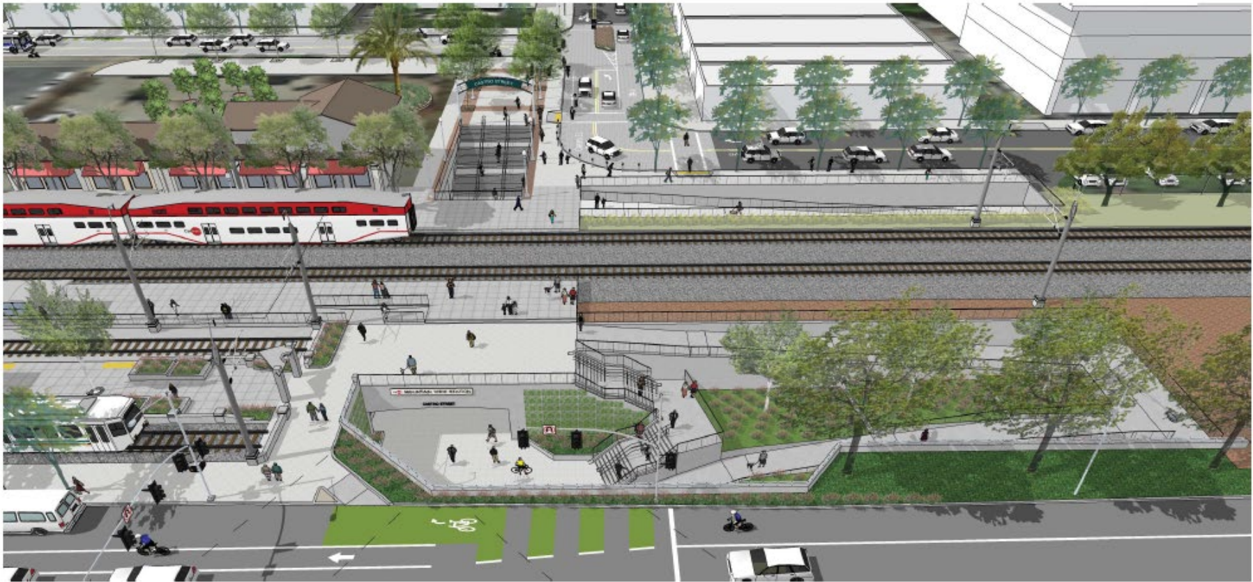
Castro Street looking south towards Downtown (planned)

Castro Street looking south towards Downtown