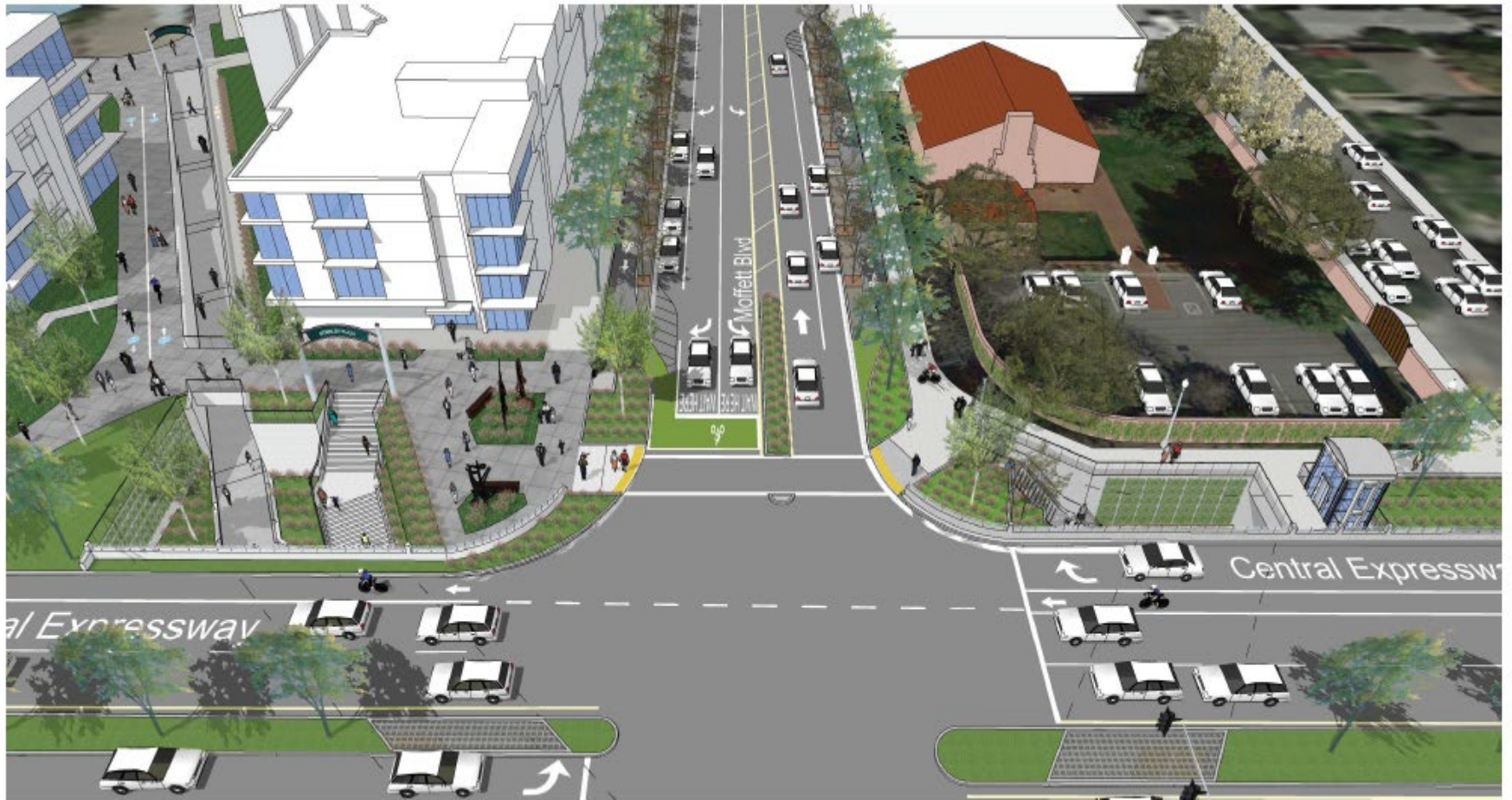
North side of Central Expressway and Moffett Boulevard Intersection (planned)