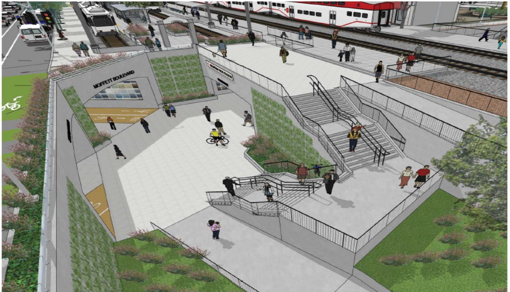
Stairs and ramps should be gracious in form and generous in dimension, making the transition between undercrossings, the Concourse, and platforms convenient and pleasant.