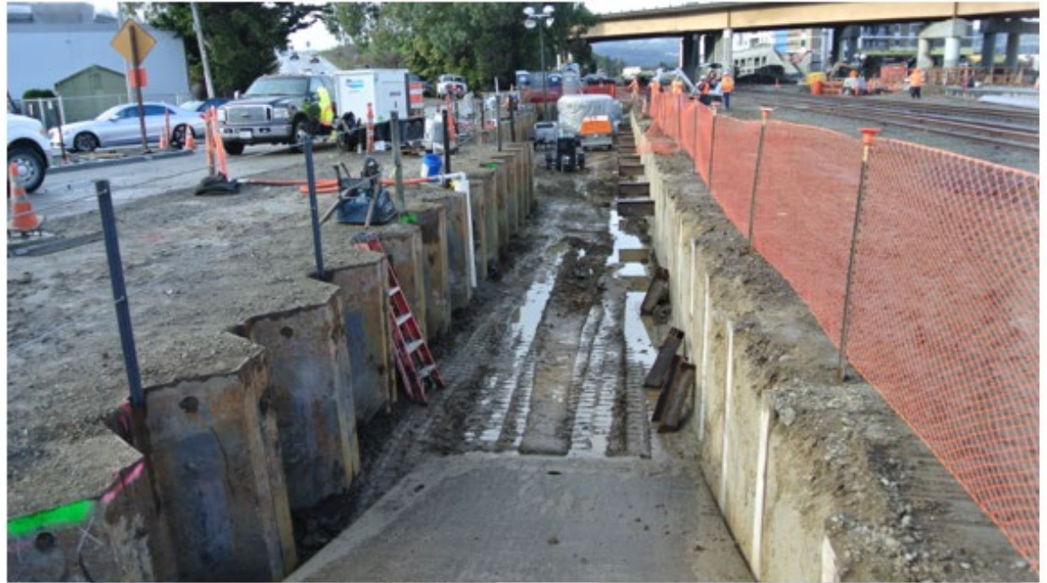
Ramp 1 Construction – Shoring (East Station Access)