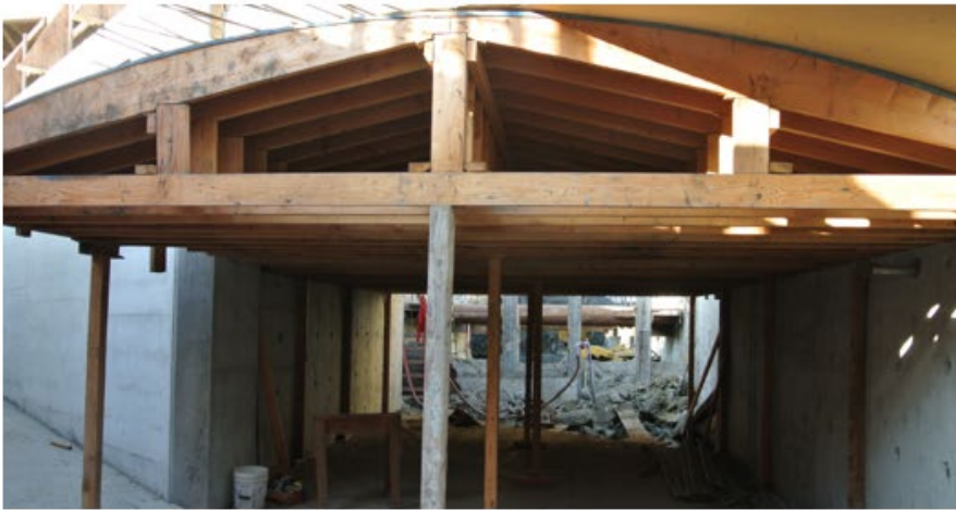
Arch Formwork to Platform and Underpass