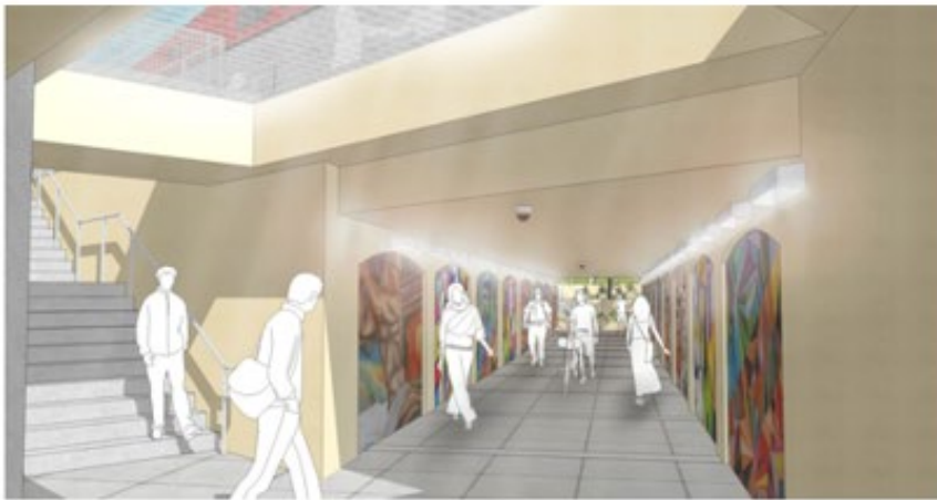
Rendering of Pedestrian Underpass