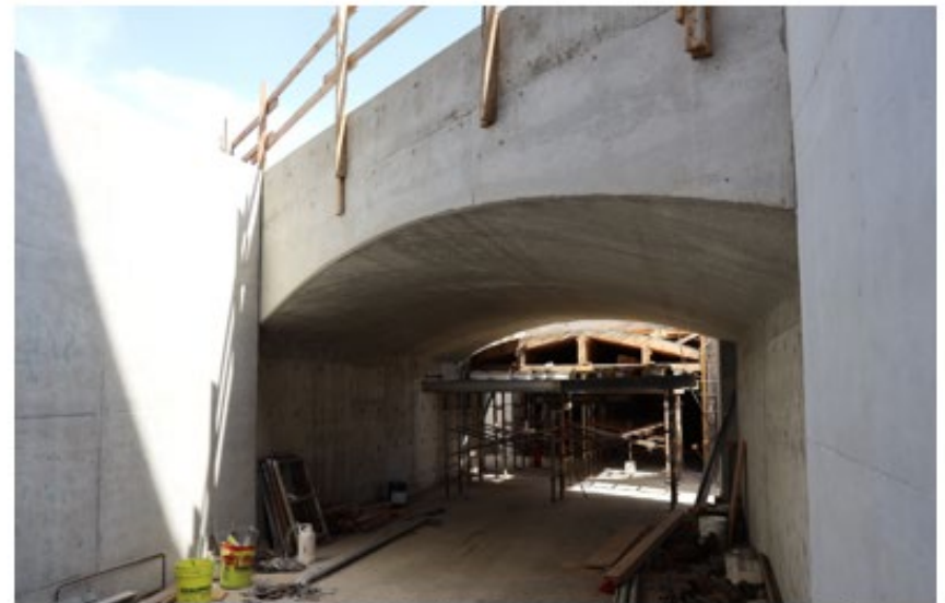
Construction of Ramp 2 Access to Platform