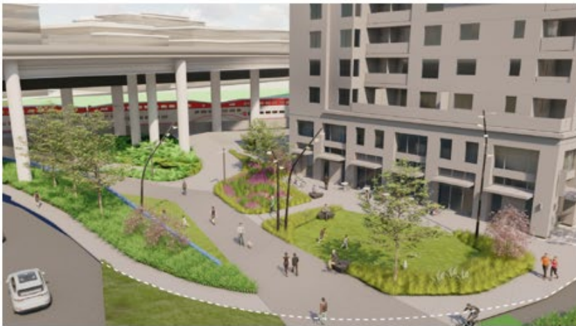
Station West Access – West Plaza