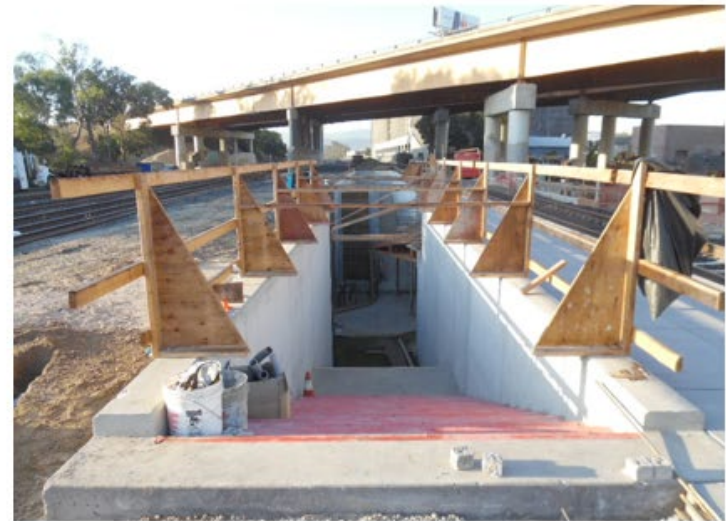
Stair 2 Access to Platform