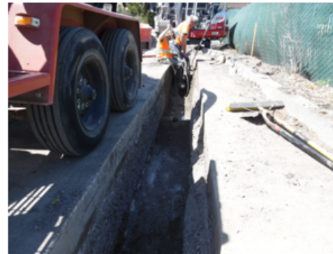
Utility Relocation – UP Joint Fiber Optic Trench (August 2020)