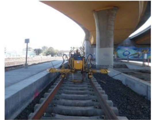
New MT2 Track – At Center Platform