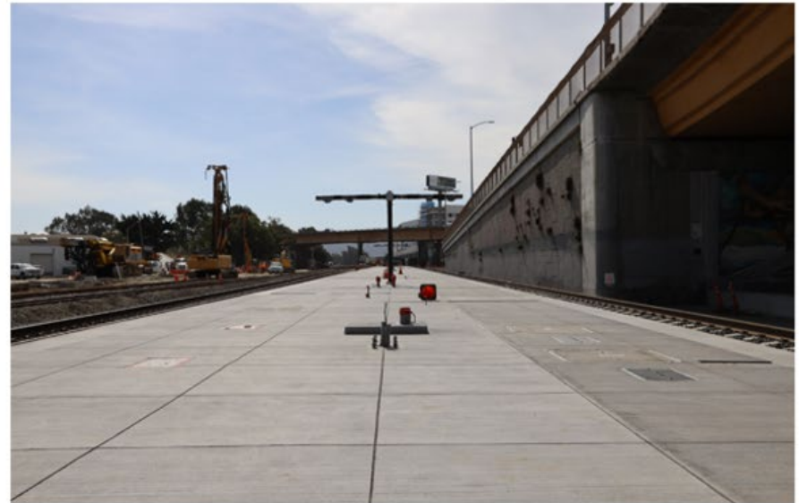
New Center Platform