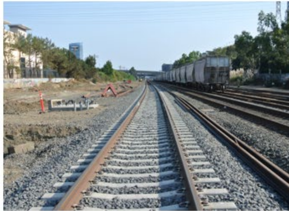
New MT2 Track – Looking North