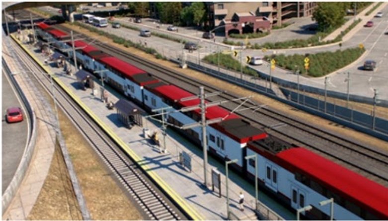
Rendering of Center Platform – Looking North