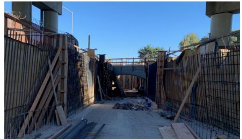
Construction of West Station Access