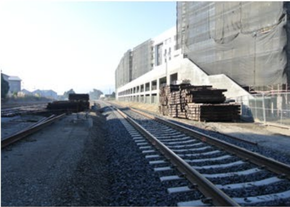
New MT2 Track – Looking South