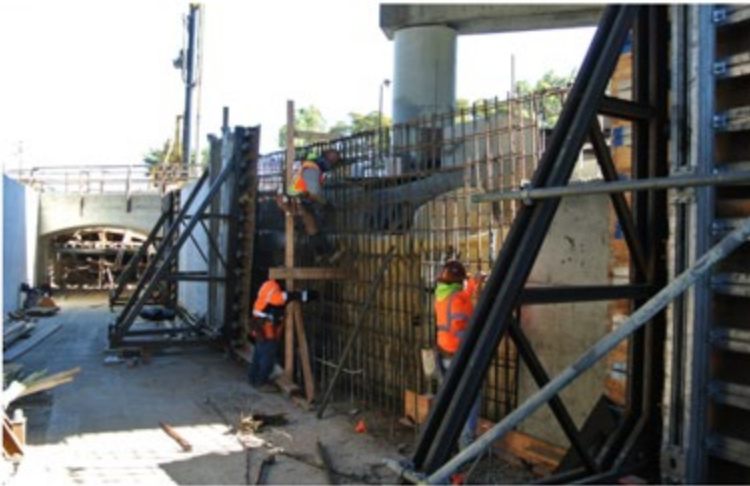
Ramp 3 Construction (West Station Access)