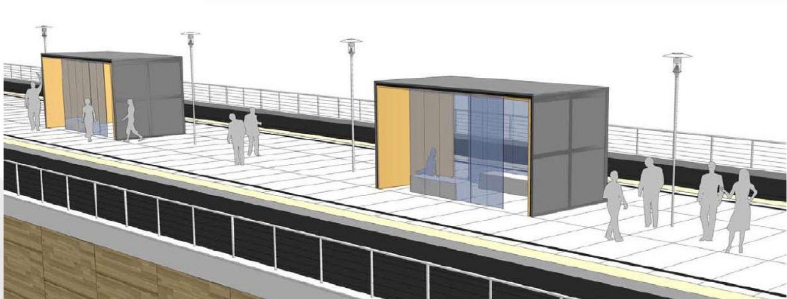
New Station Platform, Shelters, Lights