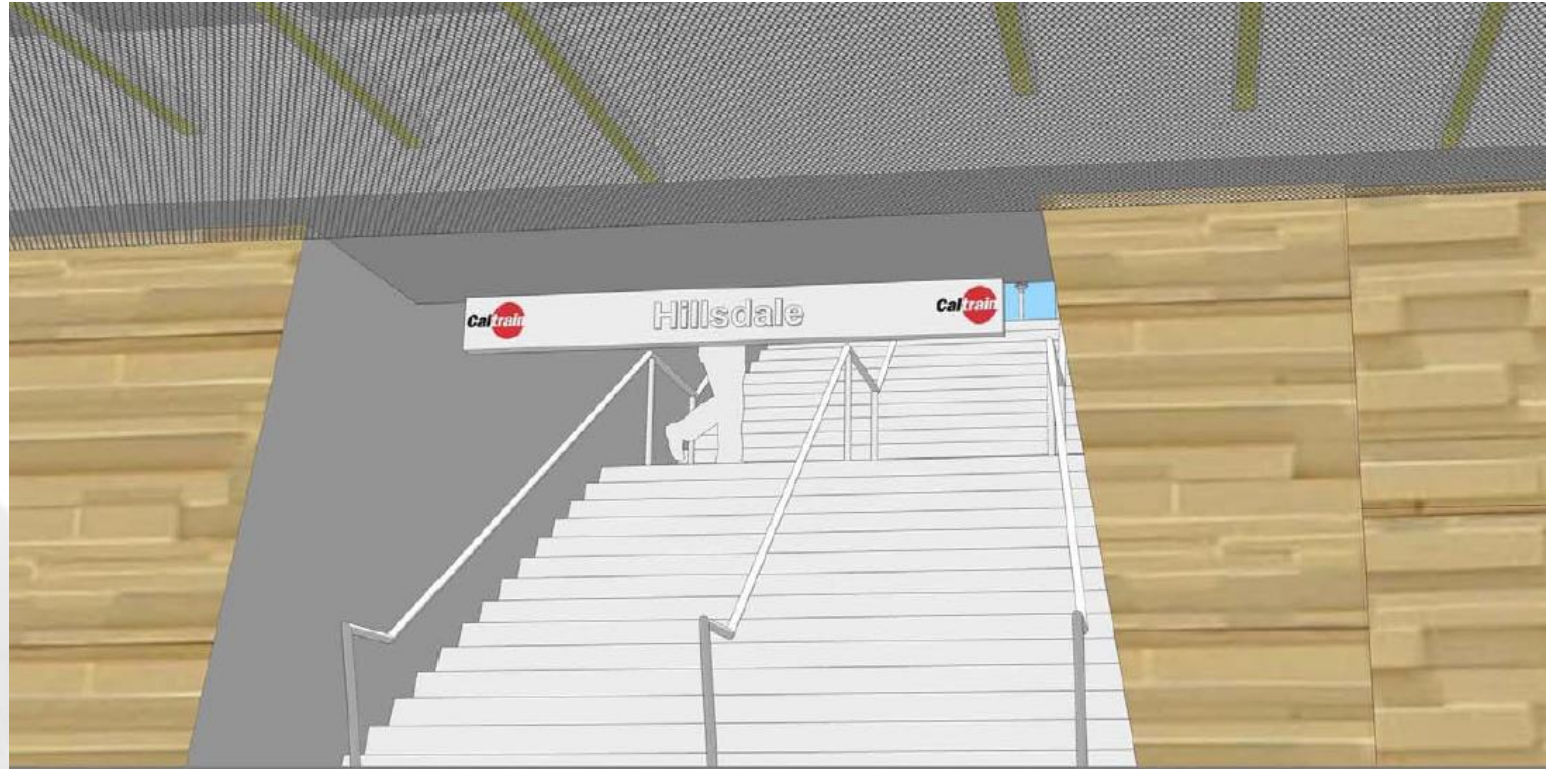
Stairway Entrance to Platform