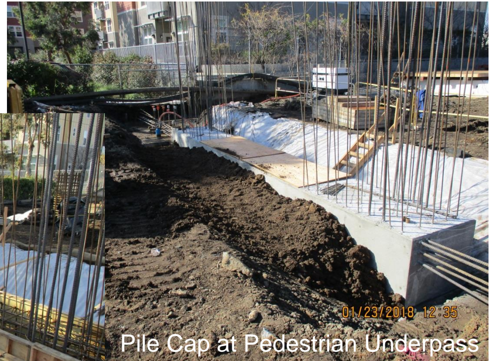
Pile Cap at Pedestrian Underpass