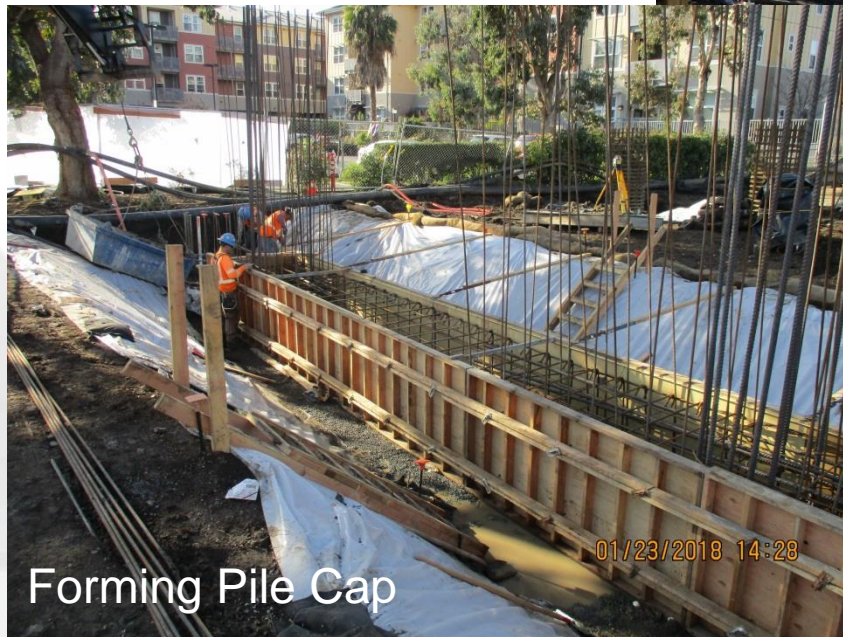
Forming Pile Cap