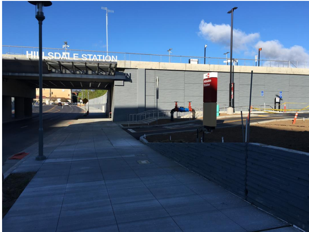
28th Avenue Sidewalk & Northern Parking Lot to Ramp Entrance