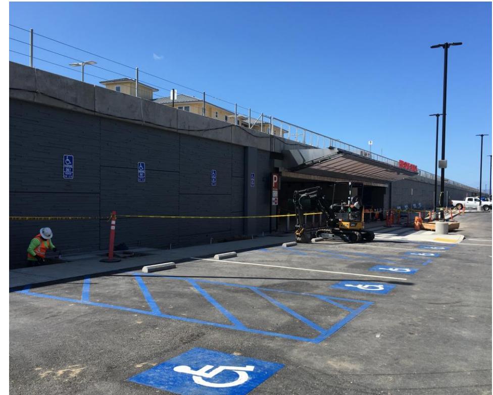
Southern Parking Lot & Underpass to Ramp Entrance