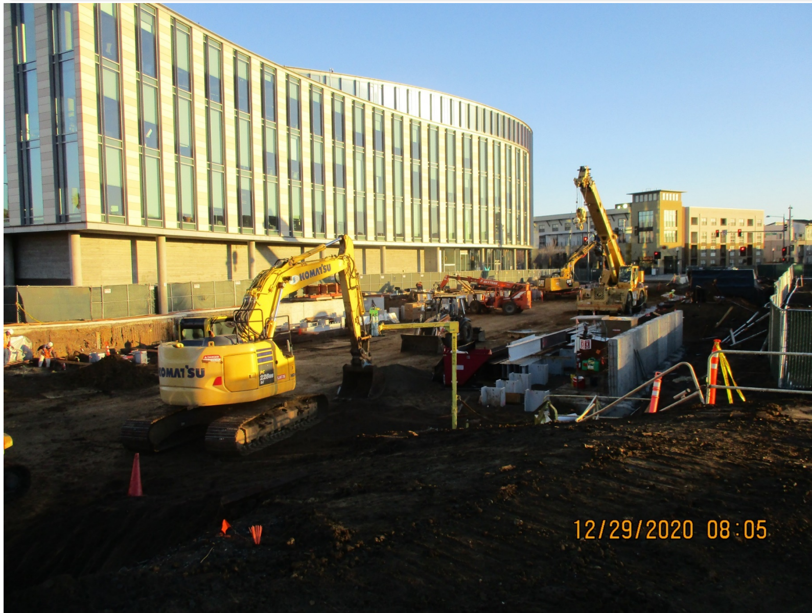
31 st Ave