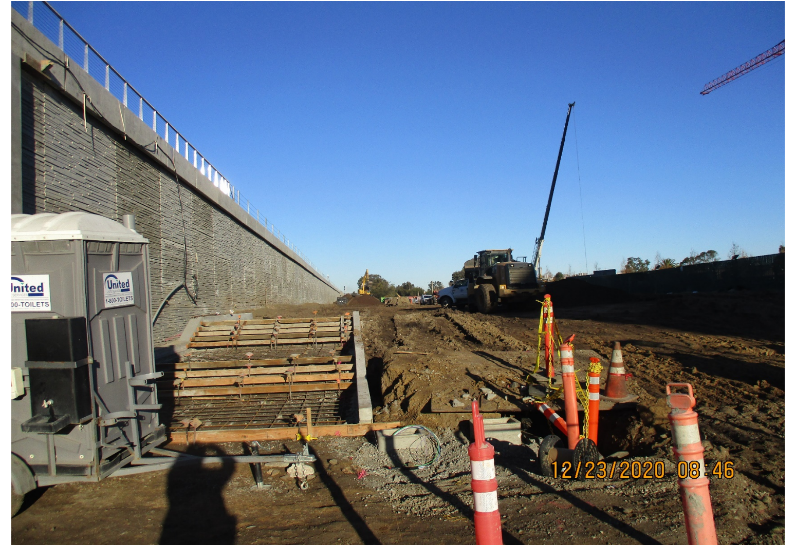
North Parking Lot