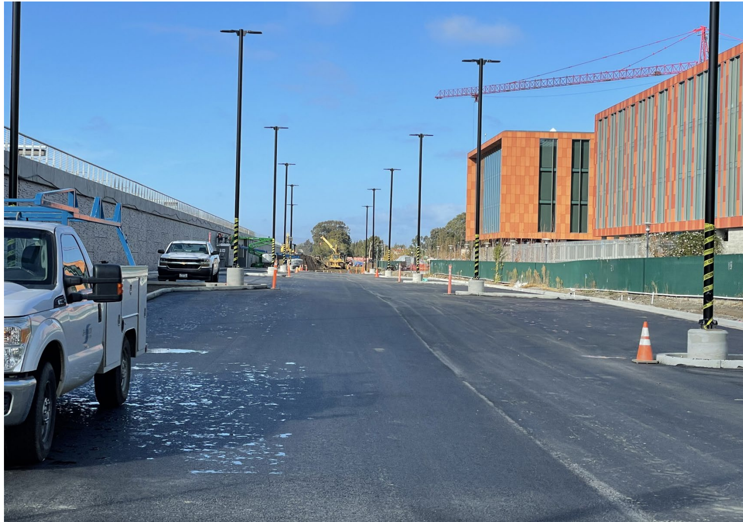
South Parking Lot