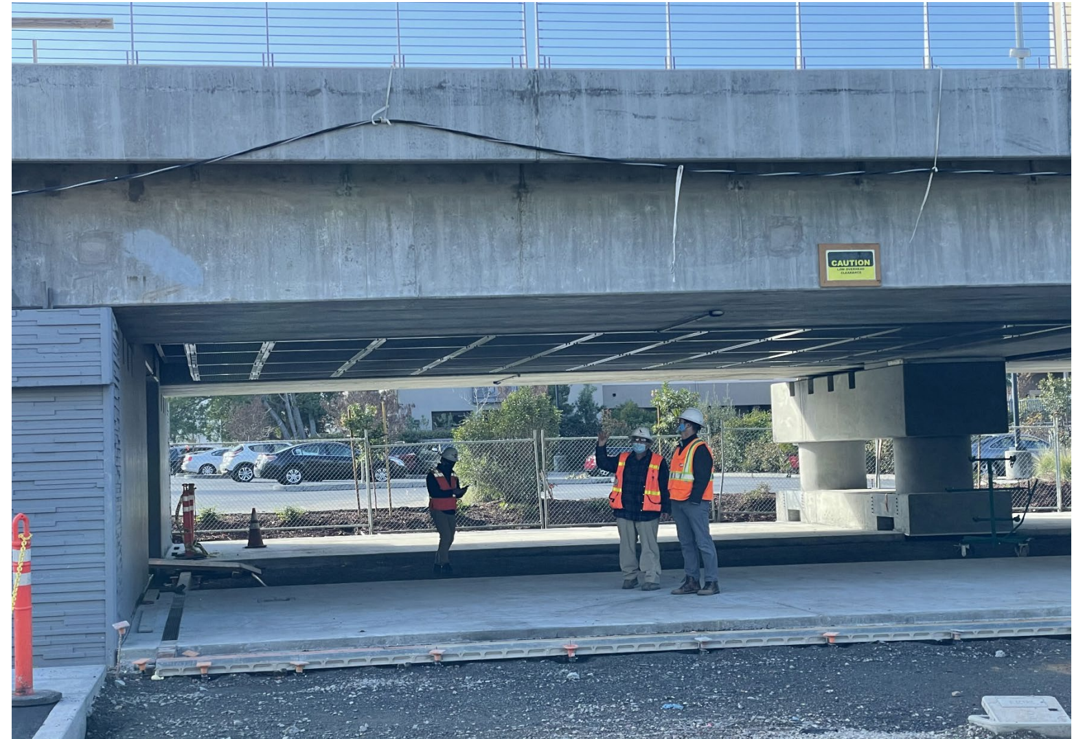
Pedestrian Underpass Bridge