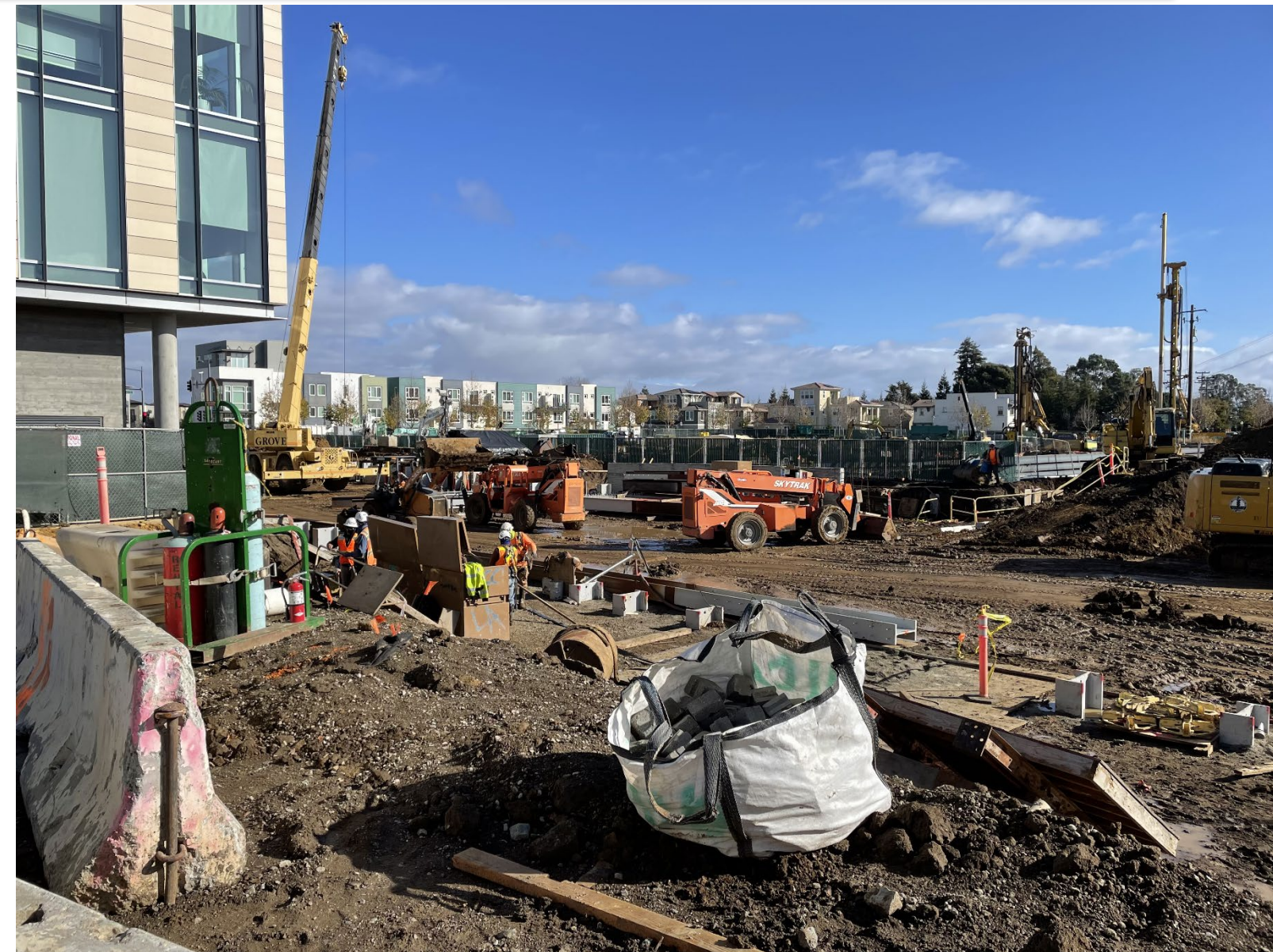
31 st Ave