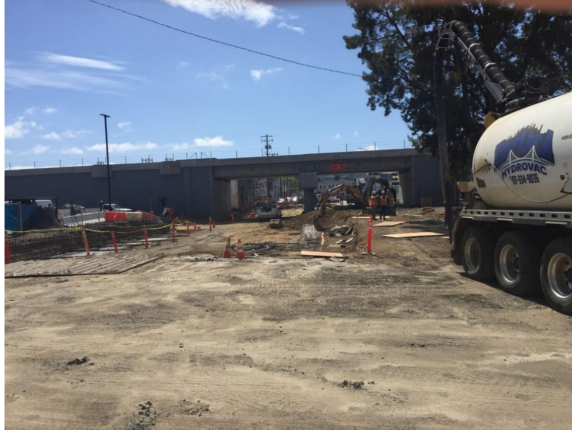
25 th Ave