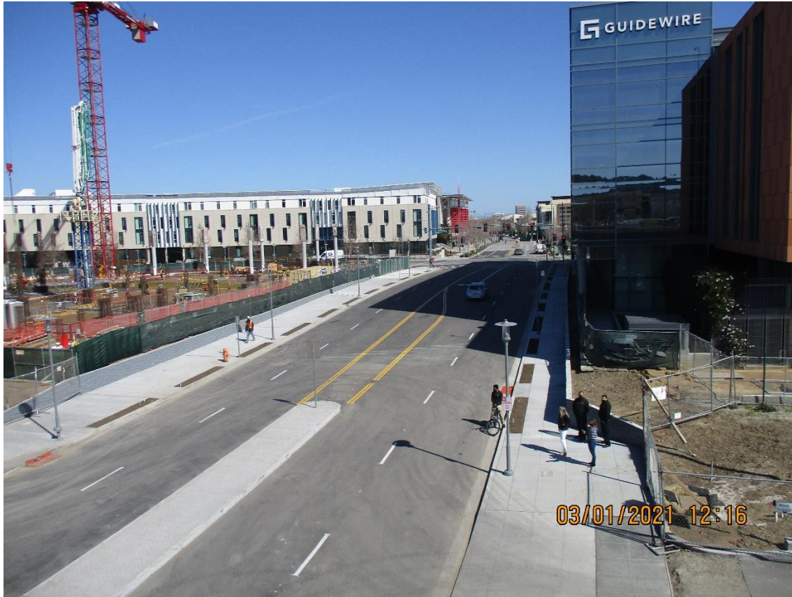
28 th Ave