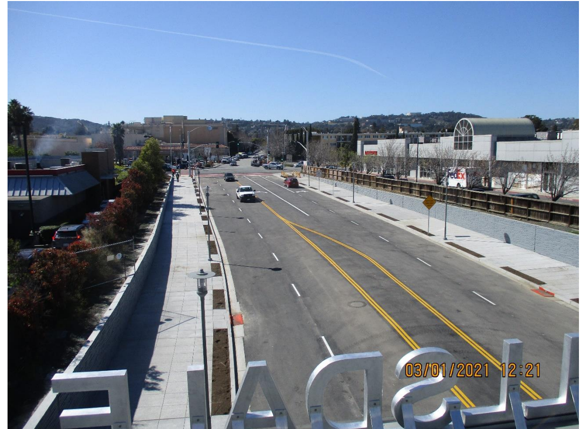
28 th Ave