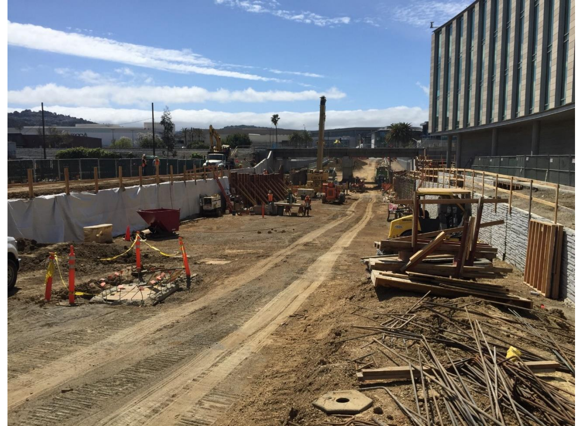
31 st Ave