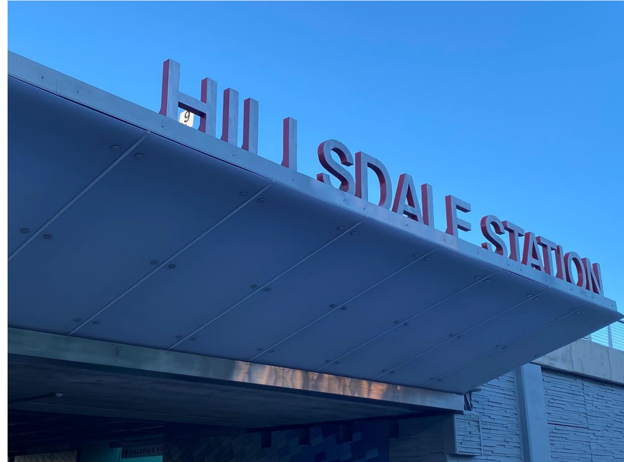
Hillsdale Station Open for Service 4/26/21