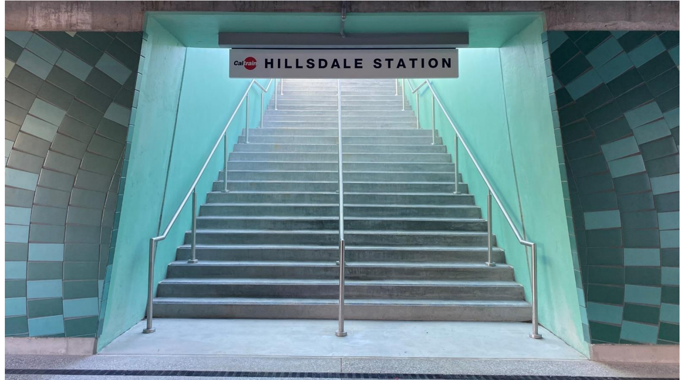
Hillsdale Station Open for Service 4/26/21