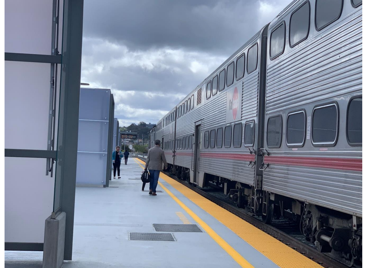
Hillsdale Station Open for Service 4/26/21