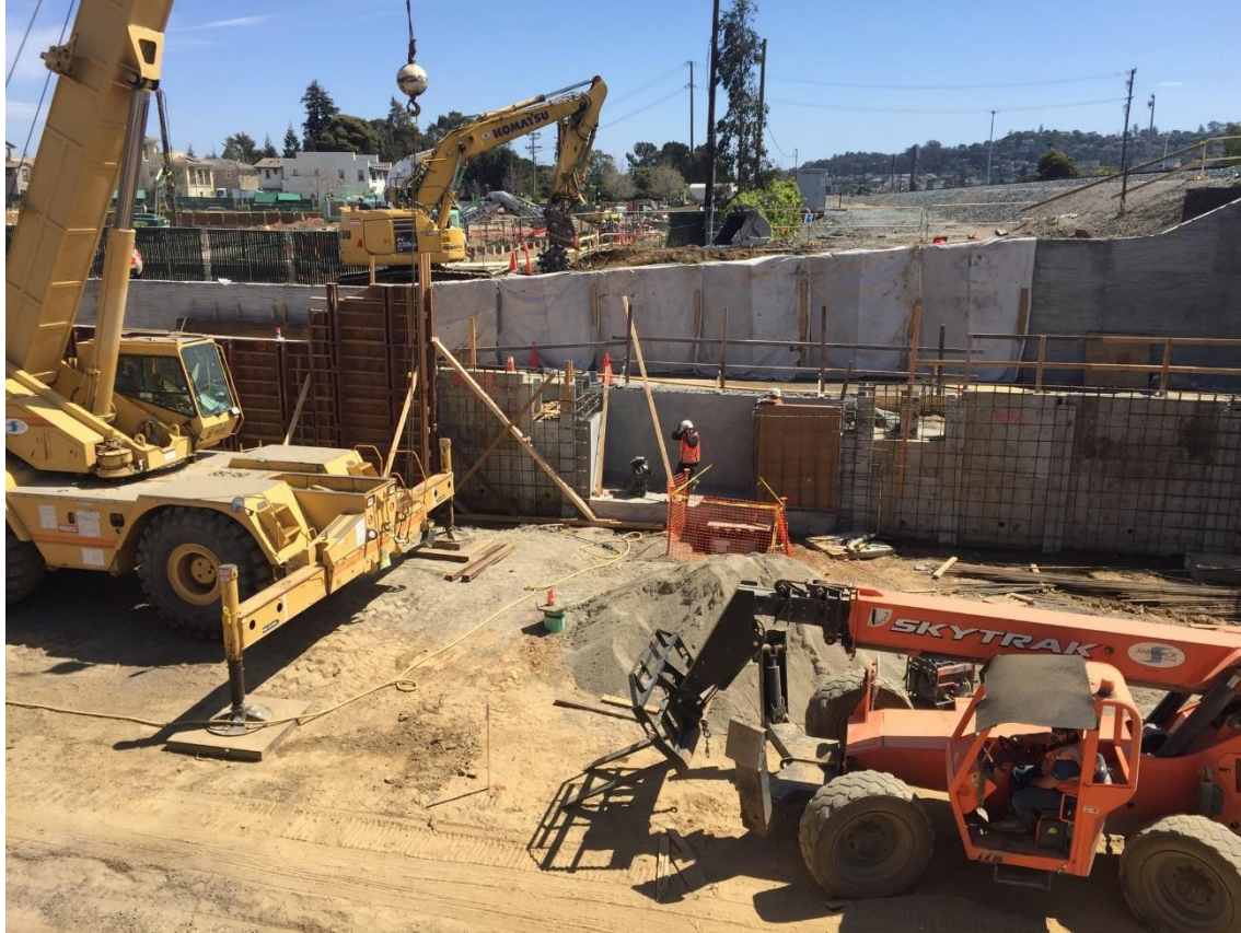
31 st Ave