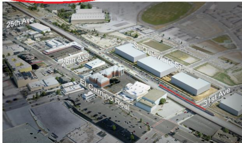
Rendering of Completed 25th Avenue Grade Separation Project