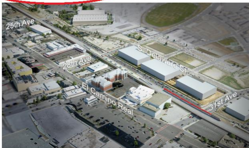
Rendering of Completed 25th Avenue Grade Separation Project