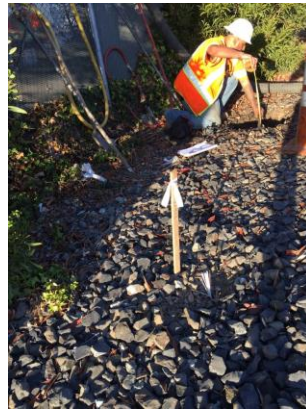
Potholing – to identify utilities