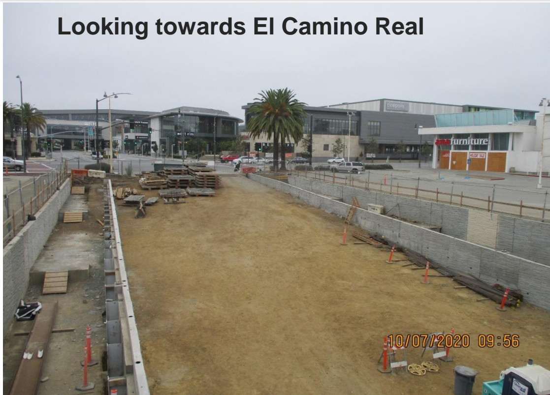
Looking towards El Camino Real