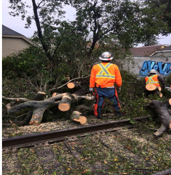
Emergency tree removal - a tree fell across both Main Line tracks in Palo Alto near Lowell Avenue (1/2 mile north of California Avenue Station) without damage to track or equipment.