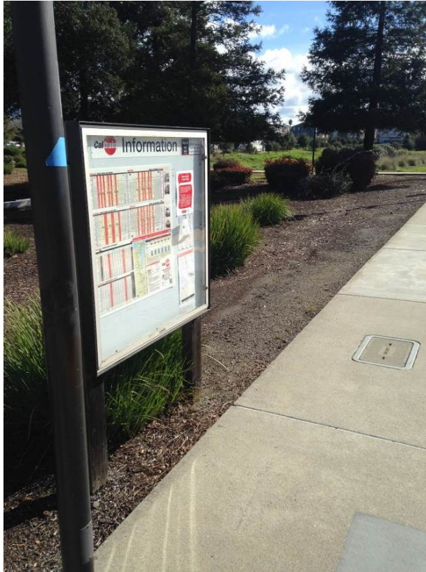
Old style schedule case