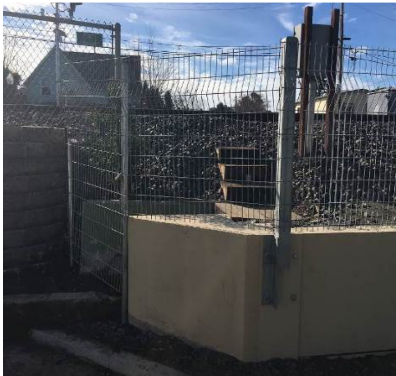
The finished product is much safer