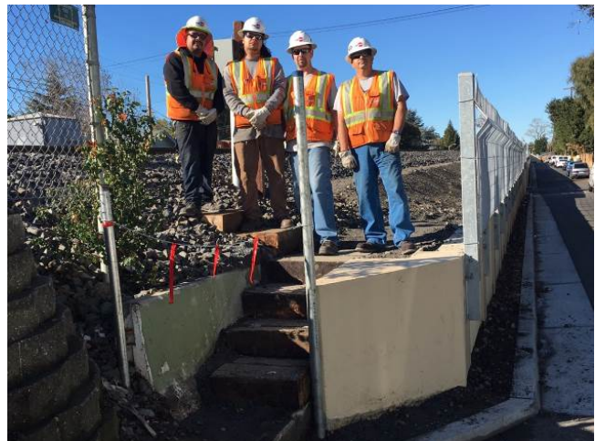
After – stairs constructed by Signal Crew