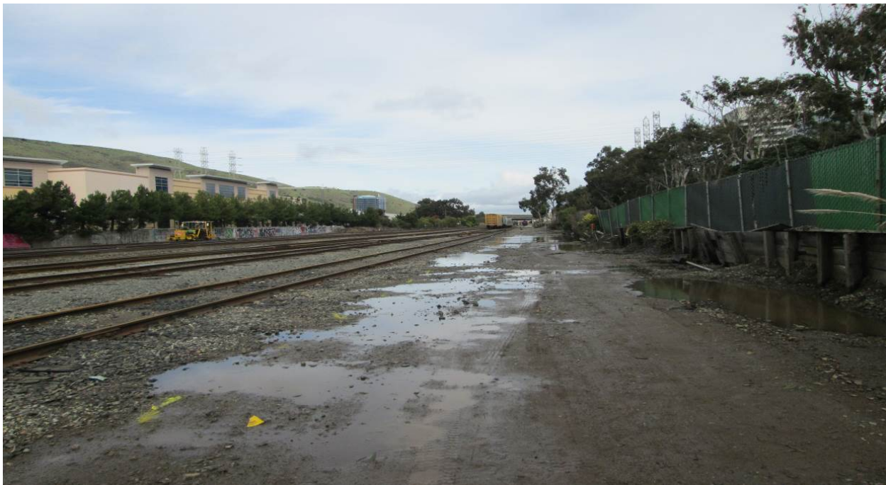
South San Francisco Yard drained and ready for tie installations again!