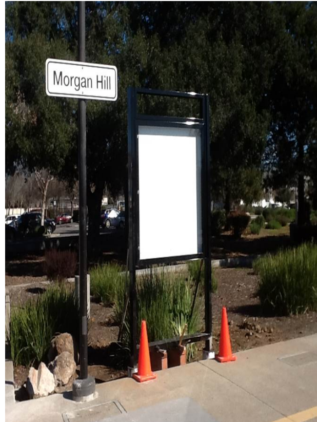
New Information display case