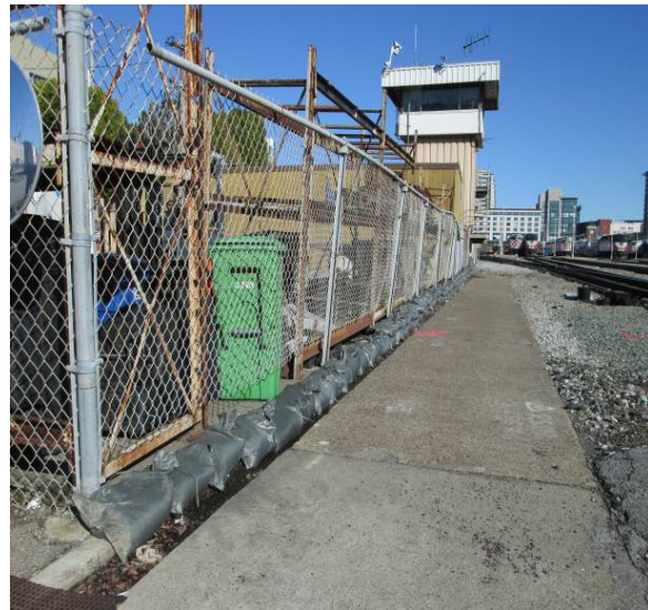
Prepared for the next storm at Control Point (CP) 4 th Street by sandbagging low lying areas in San Francisco 4 th & King Yard