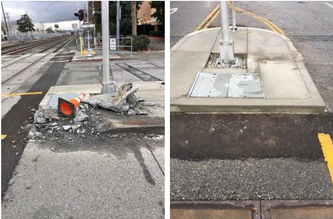
Repaired signal foundation damage at Sunnyvale Avenue, MP 38.79