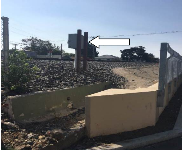
Before – difficult access to Signal Case