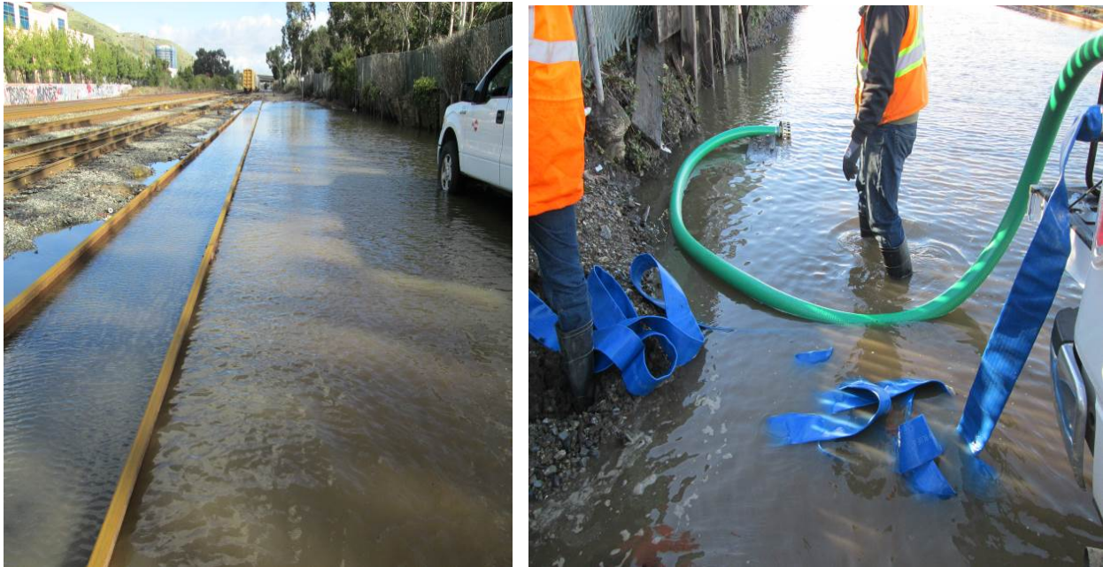
Pumping out "Lake South City" in South San Francisco Yard