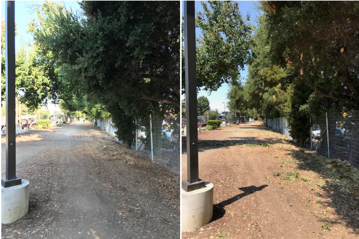
Limb removal at Sunnyvale Station