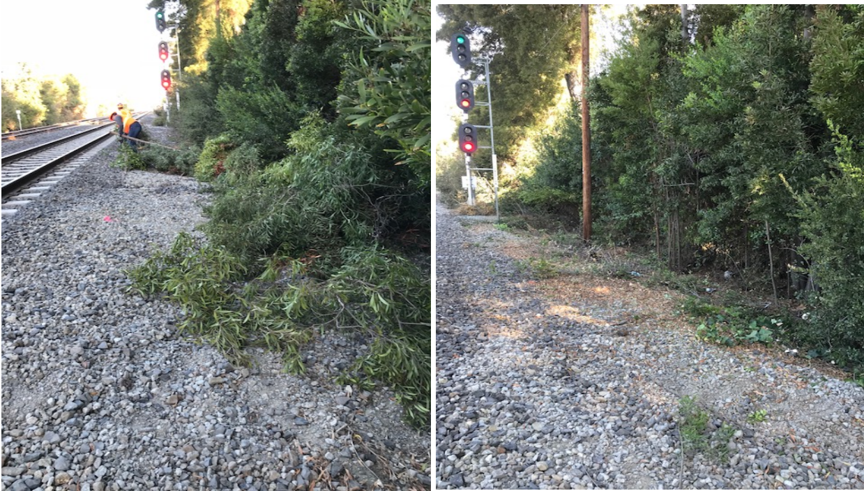
Tree trimming at MP 27 in Redwood City