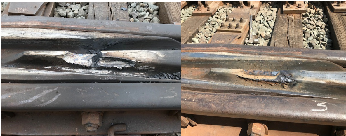
Switchpoint ground down to remove cracks in the metal and built up with new welded metal