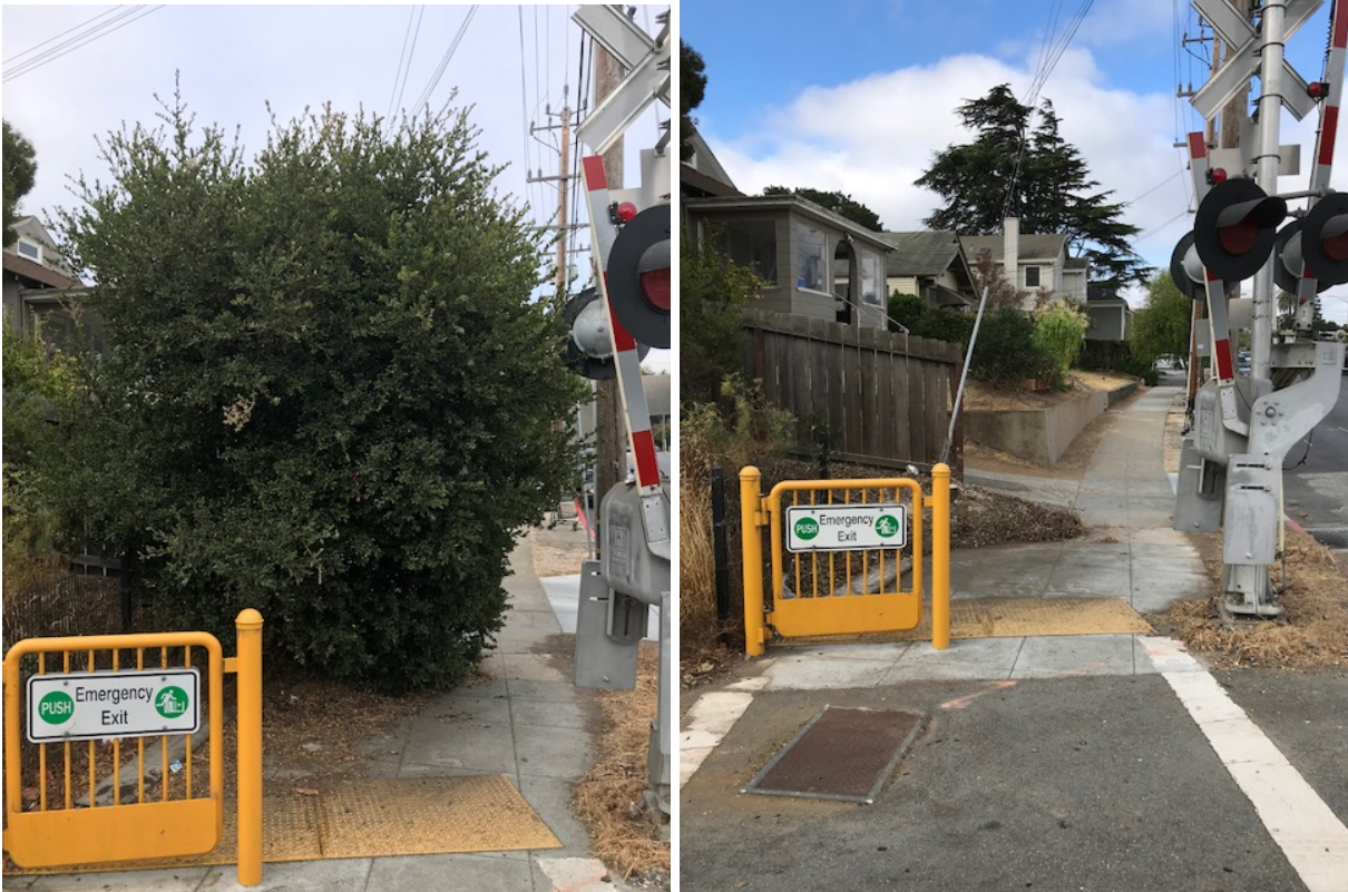
Bush removal at Villa Terrace Crossing in San Mateo