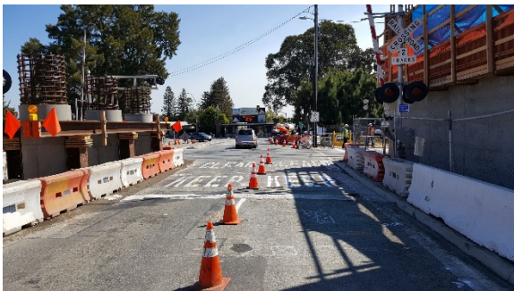
Before: East bound 25 th Avenue grade crossing

The 25 th Avenue Grade Separation project Traffic Management Plan controls were determined to be compliant.