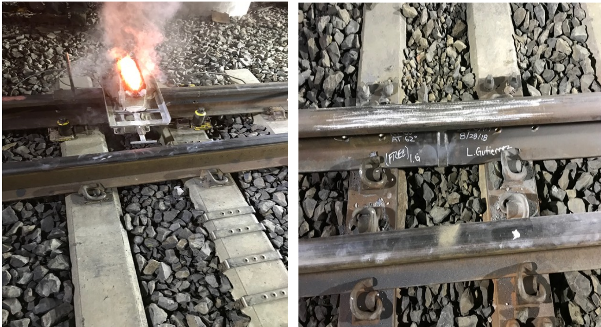
Switch point repair at Control Point Sierra in South San Francisco