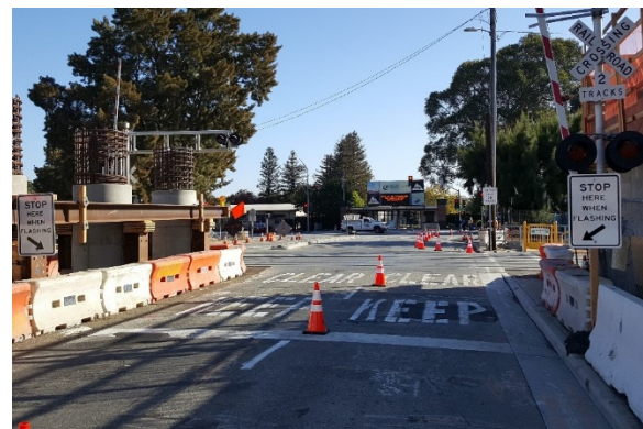
Signs added where to stop prior to designated “KEEP CLEAR” improved area

Grade Crossing Hazard Analysis is conducted as part of ongoing safety continuous improvements that are practicable and consistent along the Caltrain corridor.