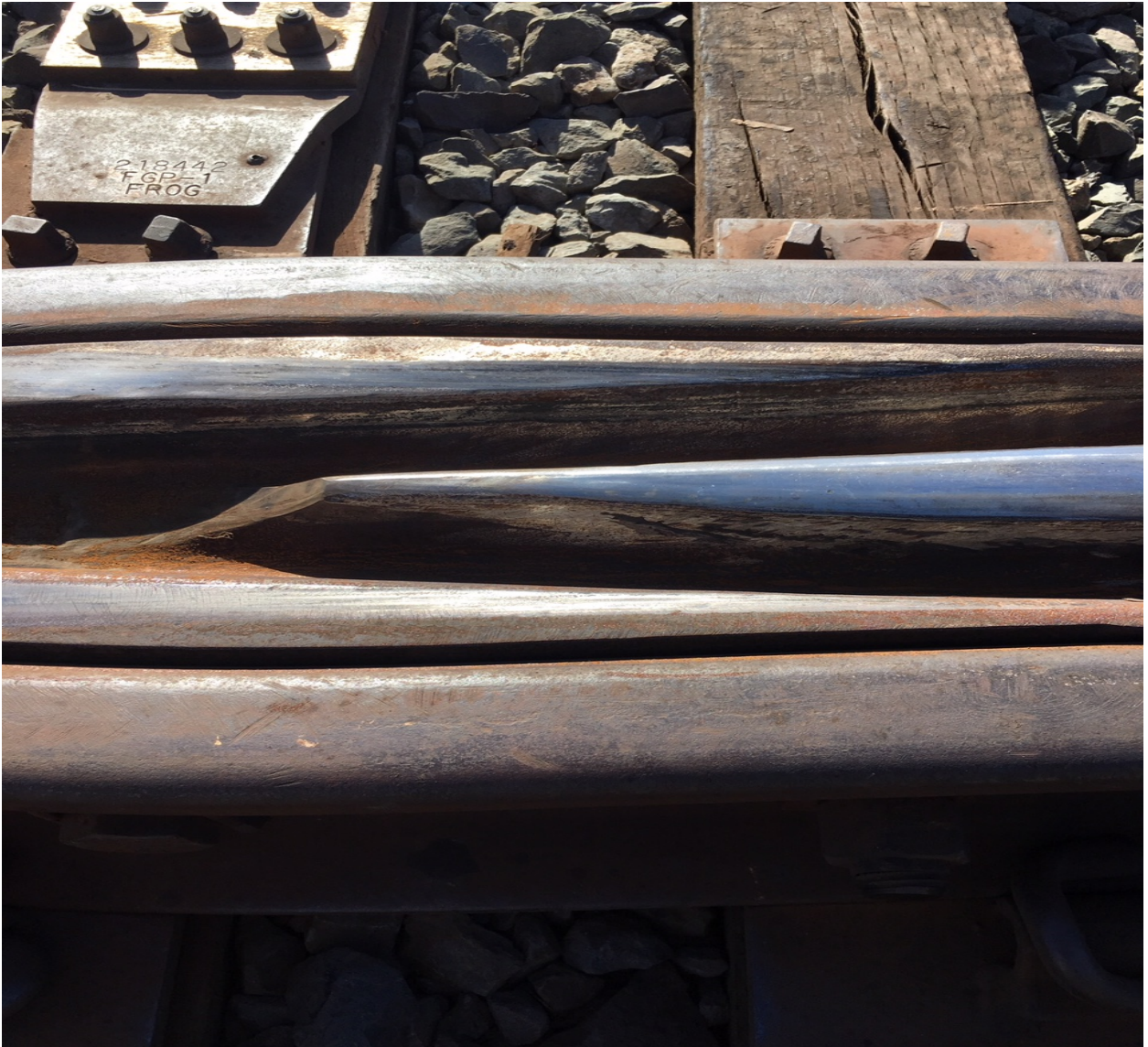
Switch point ground down and ready for service