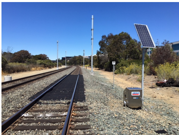
South San Francisco