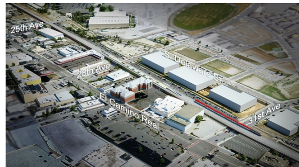
Safety enhancements have been included

The Hillsdale Station will be relocated and newly built as a center platform station (like the Belmont Station) between 31 st and 25 th Avenues in San Mateo, California. 28 th and 31 st Avenues will soon have grade crossings as a result of the recent residential and commercial construction on the east side of the tracks.