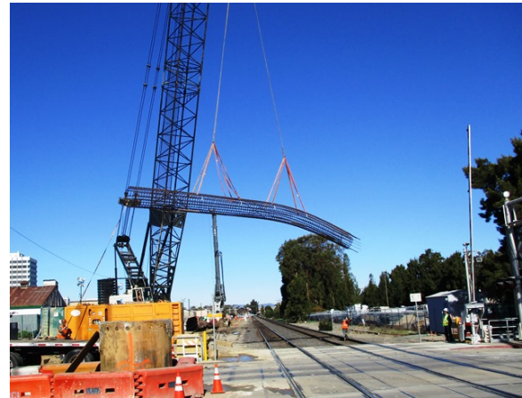
Crane work near 25 th Avenue

The 25 th Avenue Grade Separation project is underway between two Caltrain stations in San Mateo, California – Hayward Park and Hillsdale. 25 th Avenue is currently the only grade crossing between these two stations and will be grade separated. Grade separated crossings enhance safety for trains and road vehicles since their travel paths are on separate levels.