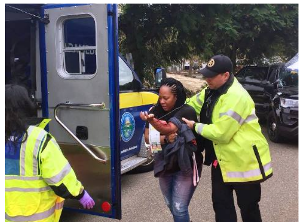
San Jose EMS and Transit PD Assist Volunteer

Emergency preparedness at Caltrain is an integral part of Caltrain Safety and Security and passenger service.