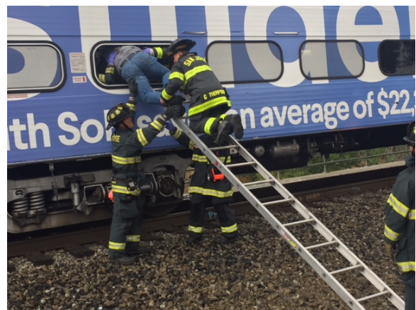
SJFD rescue via emergency exit window