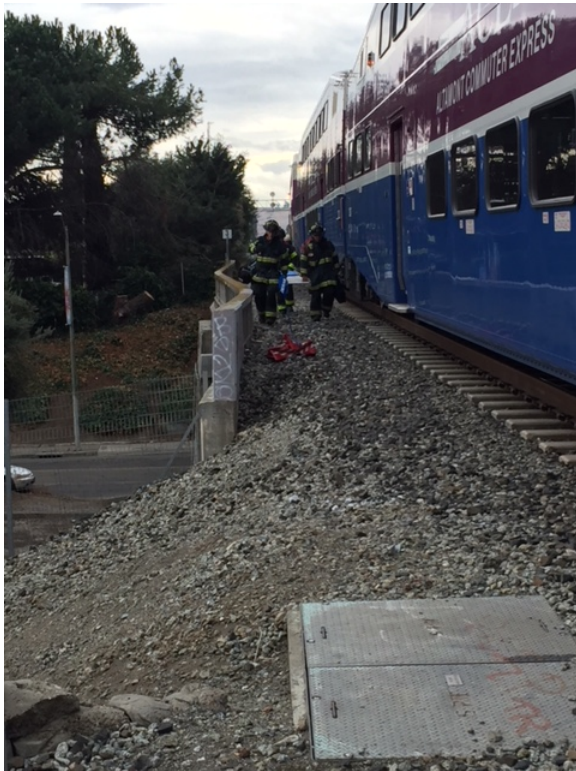
San Jose Fire Fighters approach ACE train

Caltrain conducted its annual full scale simulation exercise with Altamont Commuter Express (ACE) this year.