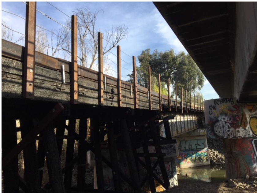
Bridge with new hand railing and cable rope installed.