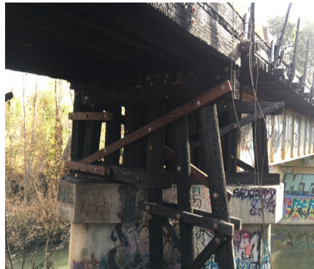
Bridge with new cross bracing installed.