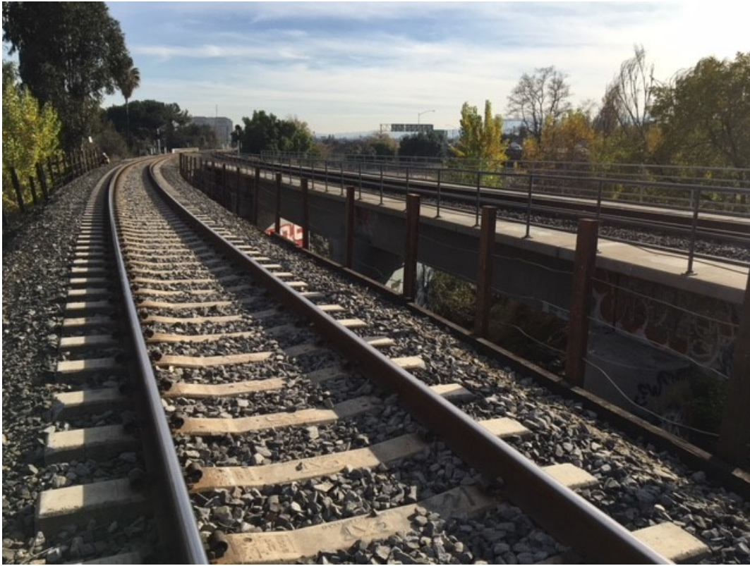
Bridge with new hand railing and cable rope installed.