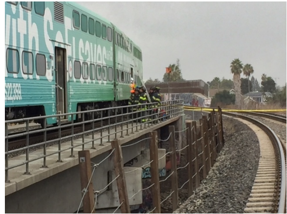
SJFD - Caltrain train on Guadalupe River Bridge

This year's emergency preparedness exercise was held in San Jose, California, just north of the Tamien Station. Caltrain Transit Police, San Jose Fire Department (SJFD), and San Jose Emergency Medical Services (SJEMS) responded to a staged derailment representing a collision between two trains. The ACE and Caltrain trains simulated the derailment collision staged over the Willow Street and the Guadalupe River railroad bridges.