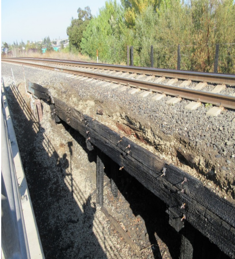
Bridge after fire and prior to repairs