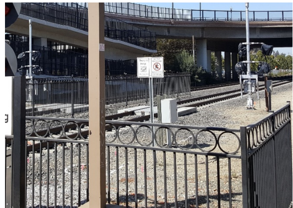
Future pedestrian gates north of current location

To address this issue currently, Transit PD conducts random High-Intensity Enforcement Program (HISEP) initiatives to educate pedestrians about safety and not crossing tracks while gates are activated. Citations are issued at times.