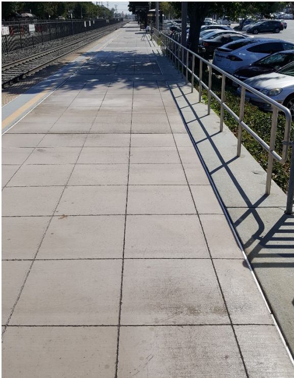
Southbound MT-2 platform completed

The Sunnyvale Station is approaching completion and the pedestrian gates on the north end of the station will be relocated north to allow six-car train consists to stop at the platform and pedestrian gates to raise up while the train is stopped.