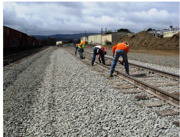
Main Track 2 relocated east

Both Main Tracks, 1 and 2, were shifted east of the previous location to make room for construction. A temporary platform has been extended north at the current station. This segregates the construction work safely from passenger train service.