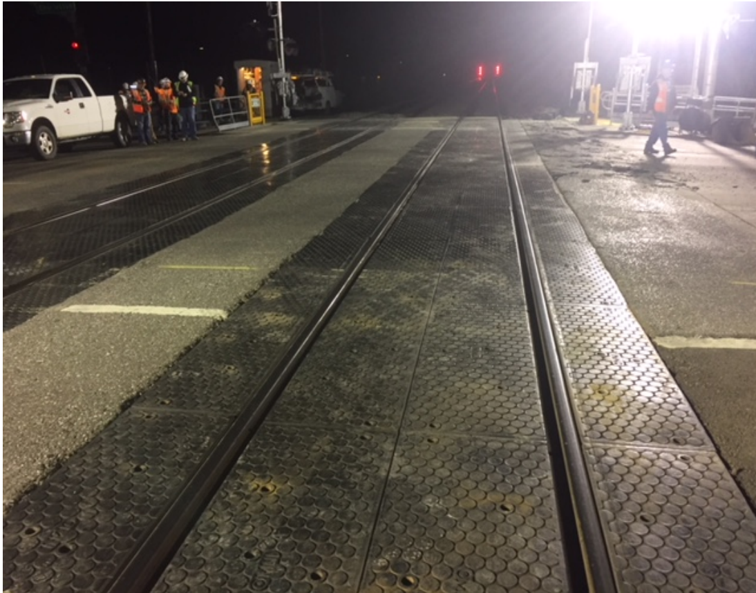
Charleston Road crossing before construction on the first weekend of work. Note the damaged asphalt and old black rubber crossing panels