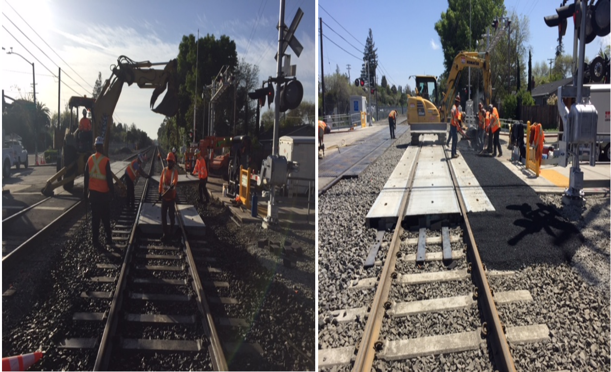
Installation of new concrete crossing panels and new asphalt roadway