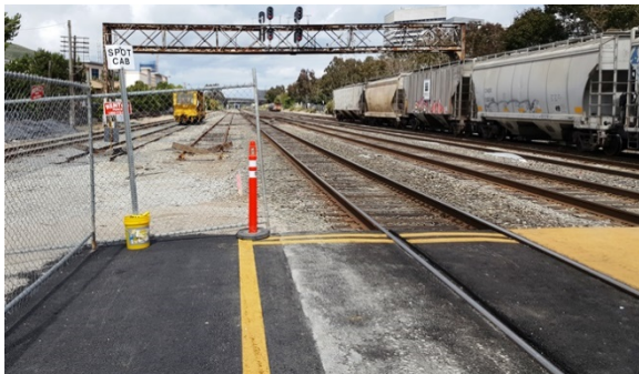
Temporary Platform Extended North

Currently, the South San Francisco Station can only be accessed from the west side of the tracks. The station will be relocated and built south of its current location and will provide access from both sides of the tracks via a pedestrian, wheel chair, and bike underpass. This will be similar to the Santa Clara Station, which has an underpass below Union Pacific Railroad tracks as will be the case at the South San Francisco Station.