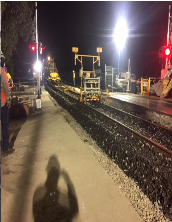
Placement of new ballast over new track and track surfacing