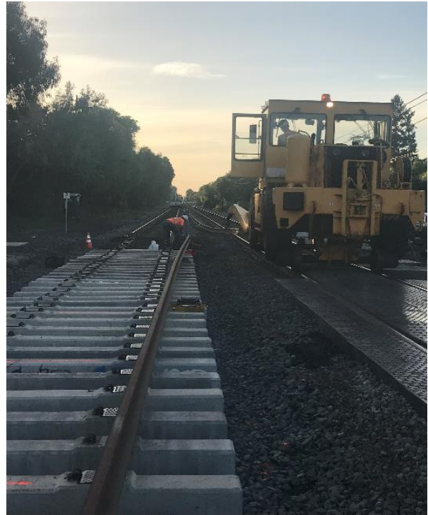
Installation of new ballast, new concrete ties and new rail