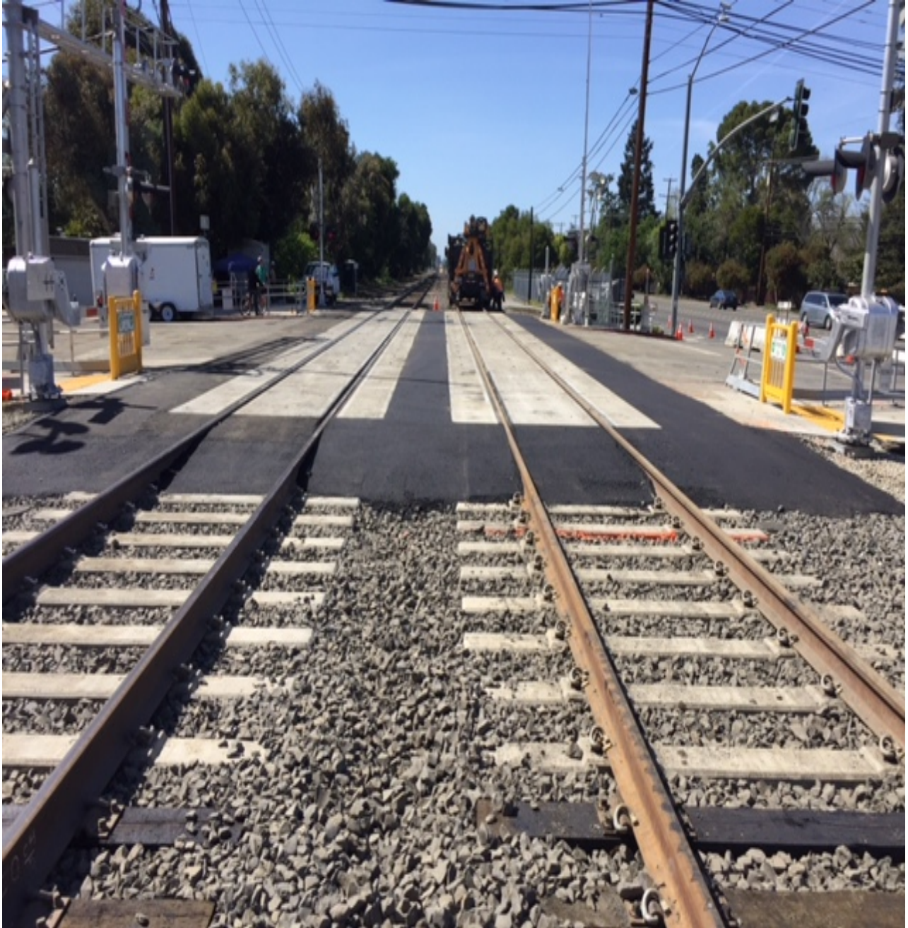
Completed track construction for both main tracks at Charleston