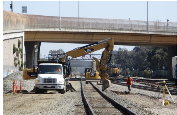
Main Track 2 Relocation Work – facing north

Both Main Tracks, 1 and 2, were shifted east of the previous location to make room for construction. A temporary platform has been extended north at the current station. This segregates the construction work safely from passenger train service.