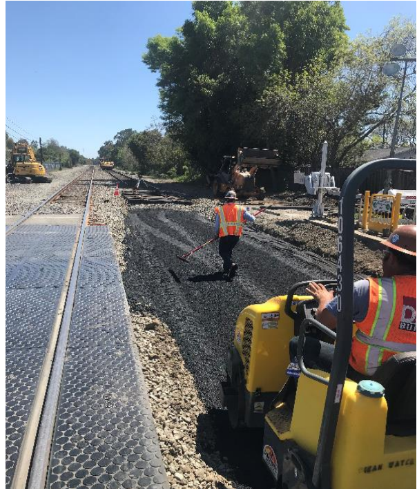
Removal of old ballast and excavation to subgrade. Installation of new underground track drainage pipe and Installation of asphalt layer below future track