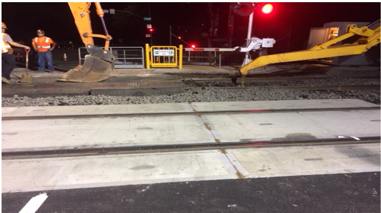
Demolition of asphalt and old black rubber panels on the second work weekend on MT-1