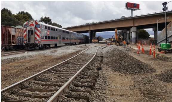
Main Track 2 Relocation Work – facing south

The South San Francisco Station Improvement project will replace the existing station with a new 700-foot center boarding platform with a new pedestrian underpass. The project improves safety and will provide increased connectivity along Grand Avenue for the City of South San Francisco.