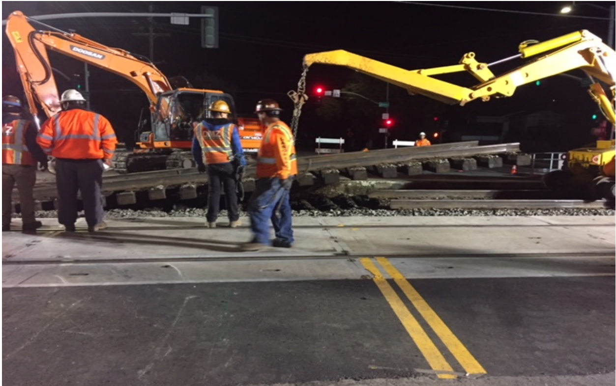
Removal of old track including worn rail and old wood ties