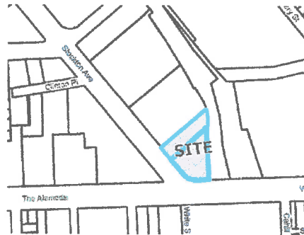
Project Location: 32 & 60 Stockton Avenue

Additional information at: www.sipermits.org