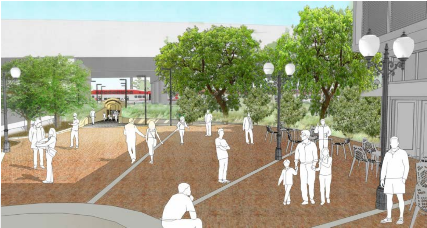
Renderings of West Plaza - Station Access