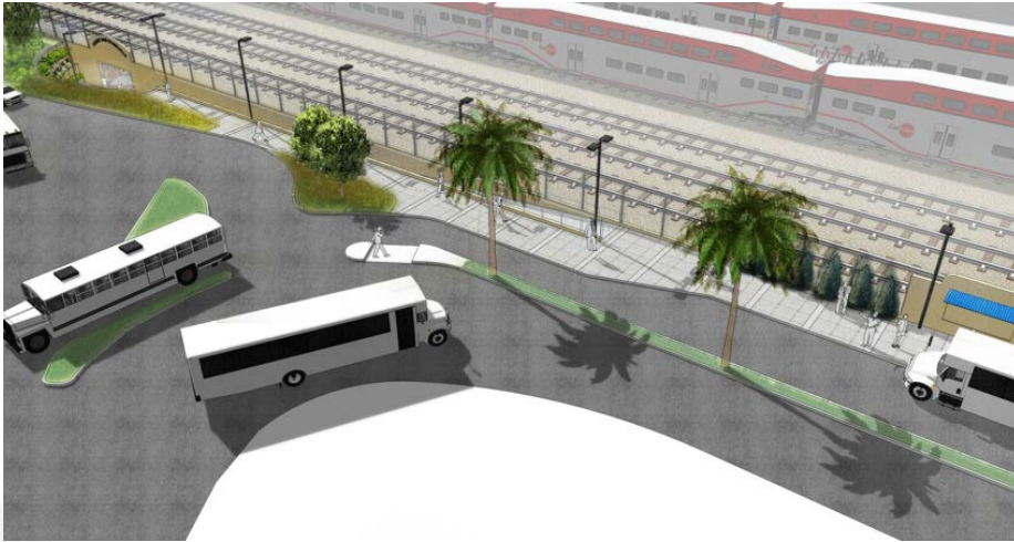
Renderings of Shuttle Drop off Area – Poletti Drive