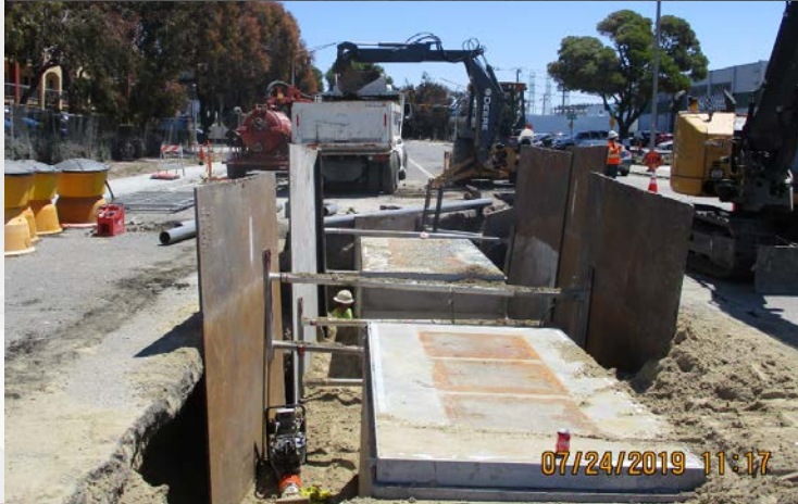
Splice boxes on Grand Avenue

PG&E Electric Relocation – completed Sept. 2019