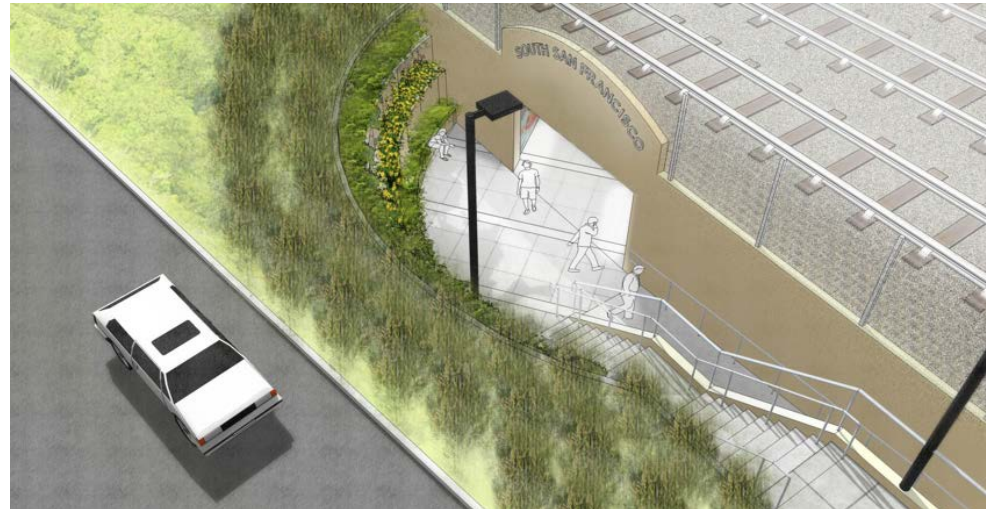
Renderings of East Station Access – Poletti Drive