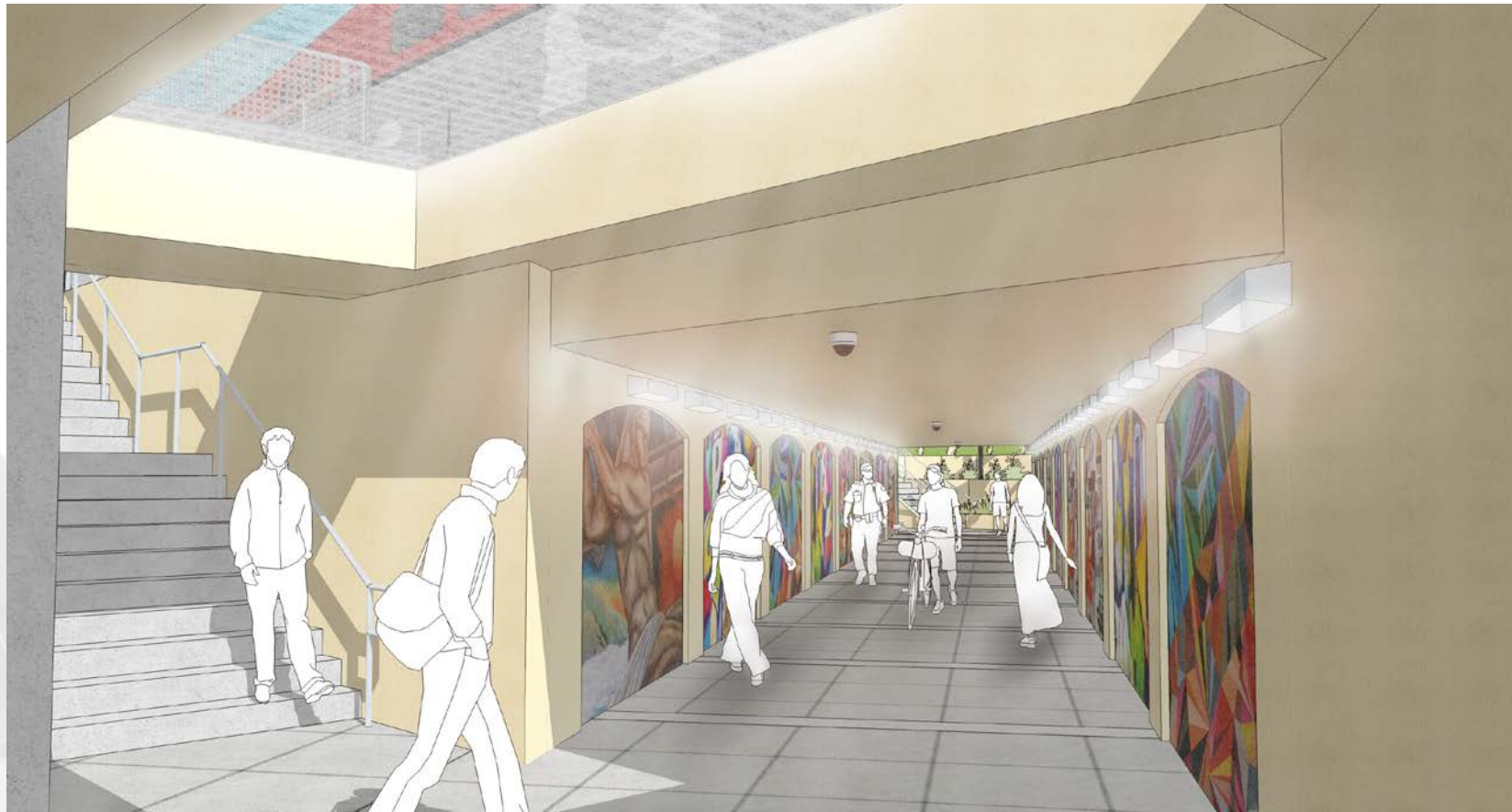
Renderings of Underpass - Station Access