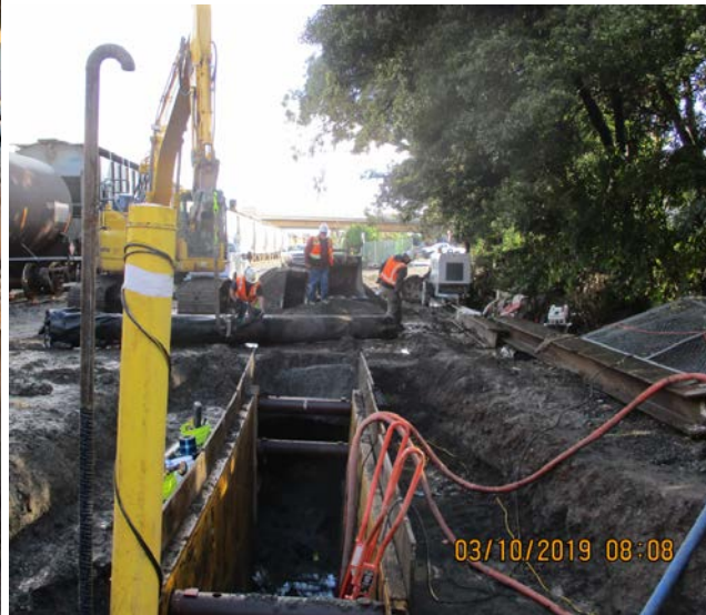
18 inch water main East side UPRR track