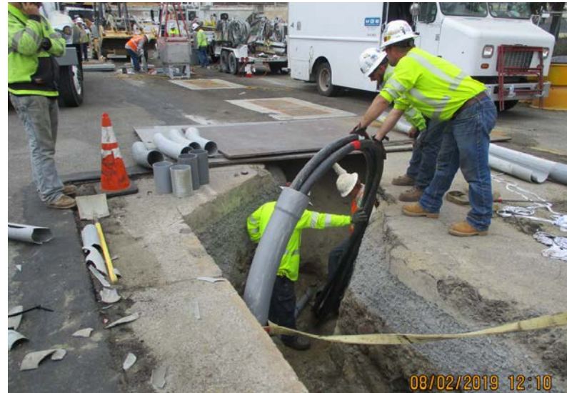
Routing from Splice box to termination point