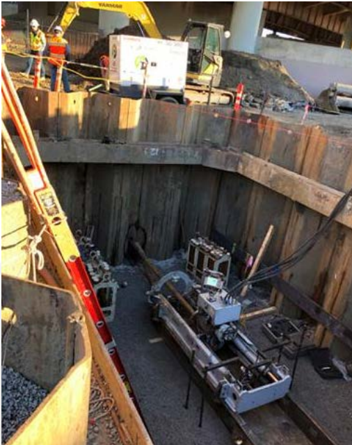
Shoring and Main installation - West Plaza