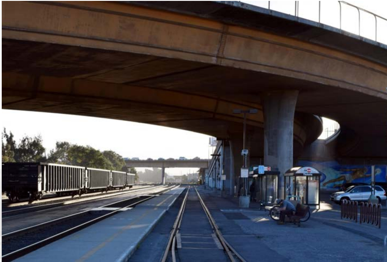
Existing Platform – South San Francisco Station Boarding