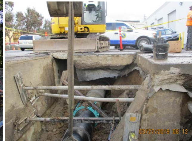
Water main tie in East Grand Ave.

CalWater Relocation – completed April 2019