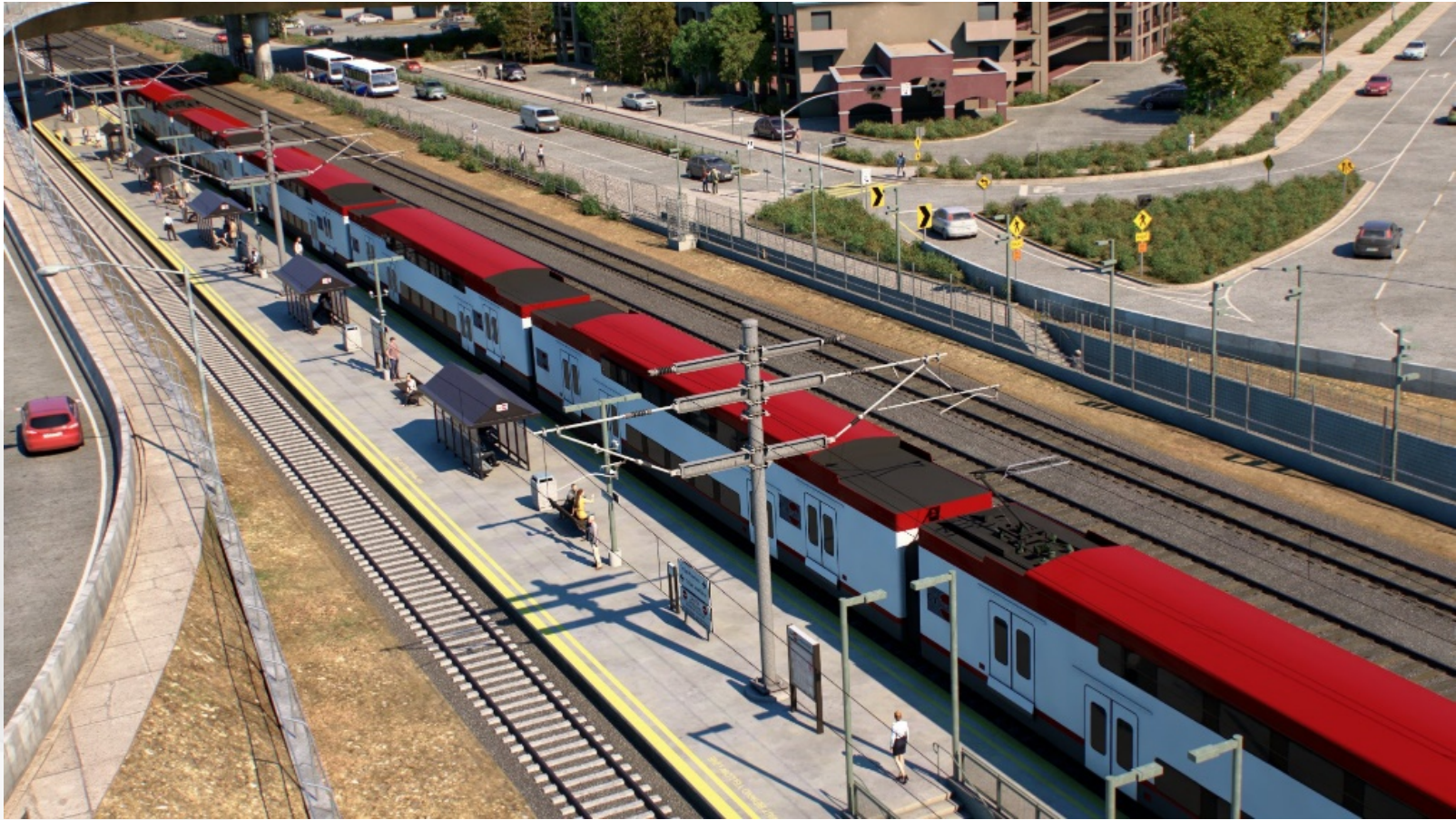
Renderings of Center Platform – Looking North