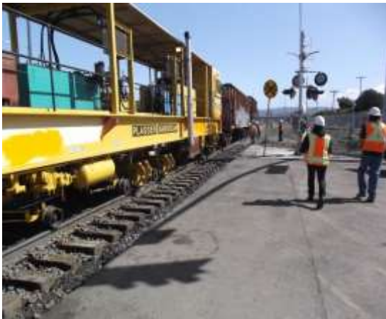
Surfacing Linden Avenue