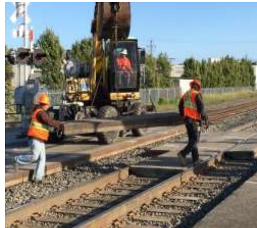
Reinstall grade crossing panels