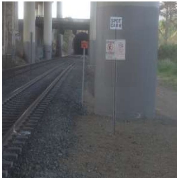
22 nd Street Station