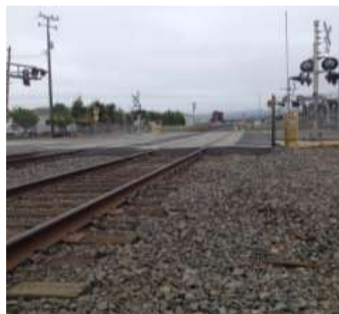
The finished product at Linden Avenue