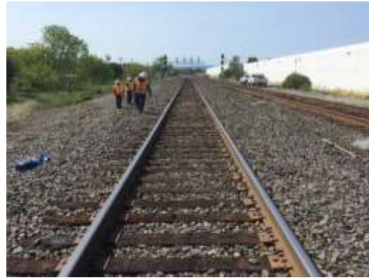
After work was completed