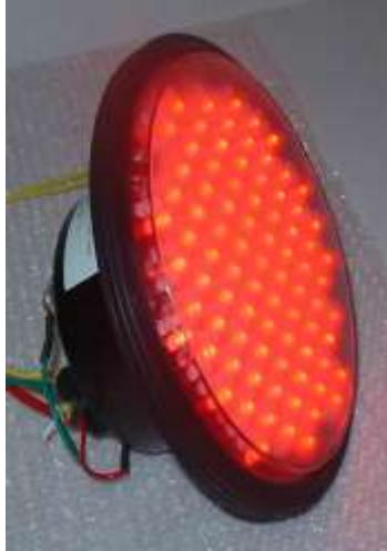
New LED lens