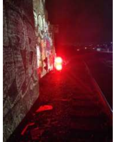
Increase luminosity at night