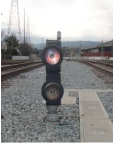
Existing Signal at San Jose Diridon