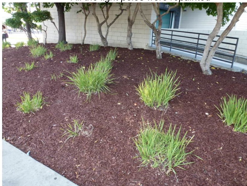
Added new mulch throughout the station