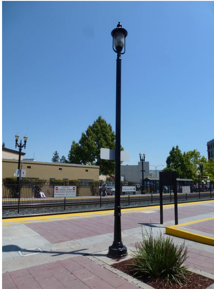
All the light poles were repainted