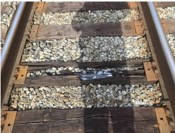
Before the replacement of ties