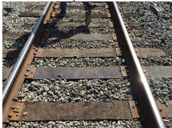
New ties installed