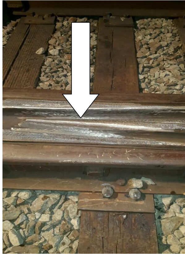
Manganese is added, frog point is restored