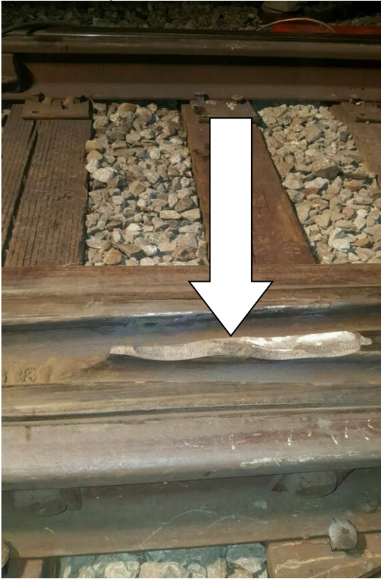
Frog point is ground down to remove cracks;