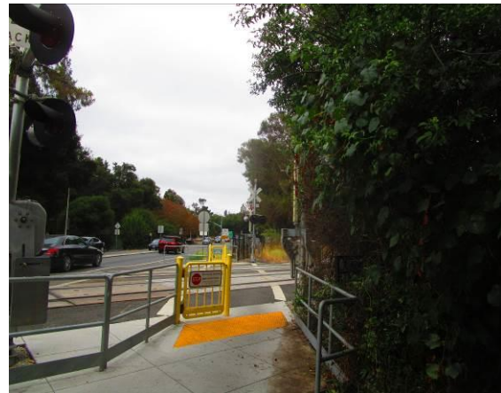
Vegetation removal at Alma Avenue grade crossing in Palo Alto