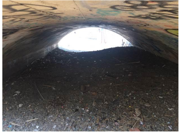
Work completed at Cordilleras Creek