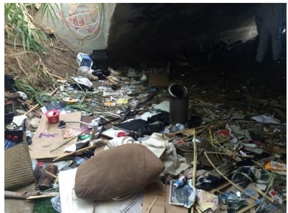
Previous conditions at Cordilleras Creek in San Carlos