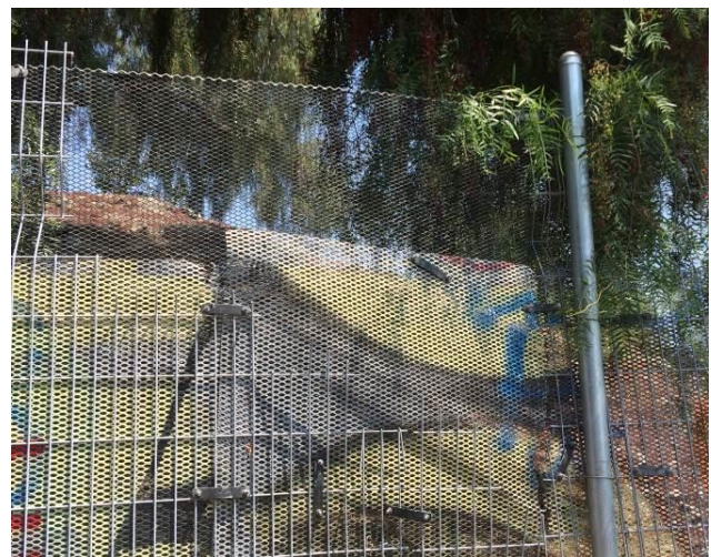
Fence repaired at Curtner Avenue in San Jose