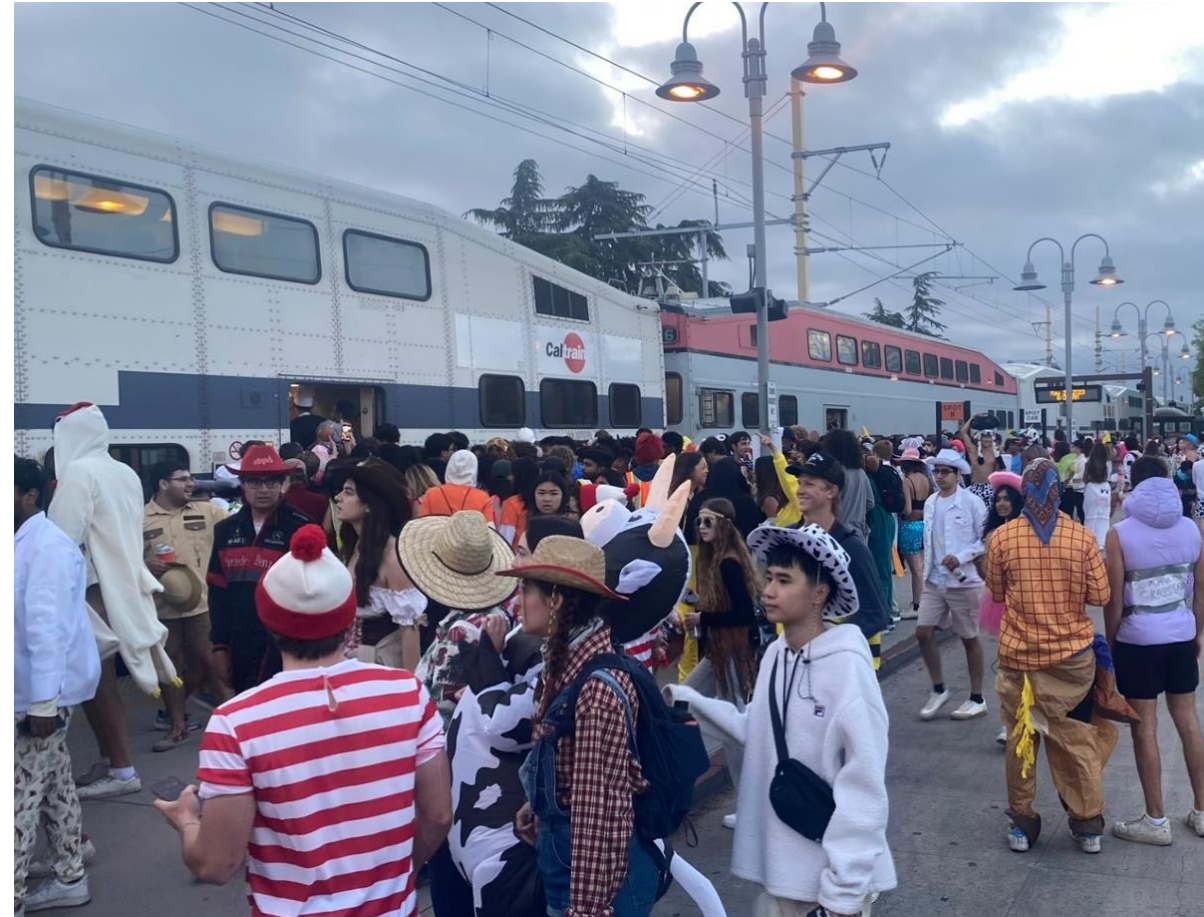
May 21, 2023 Bay to Breakers Caltrain Special Service