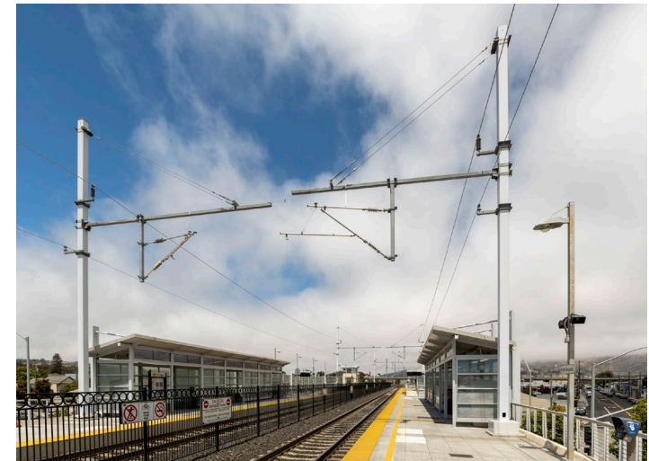
Overhead Catenary System