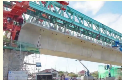
Construction of the North-South Commuter Rail (Philippines)