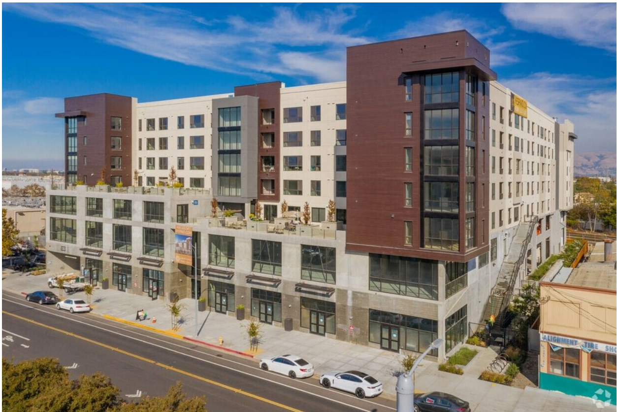
Vespaio 162-unit apartment complex with the 60 Stockton Avenue tire shop to the right (Caltrain tracks are visible in the background).