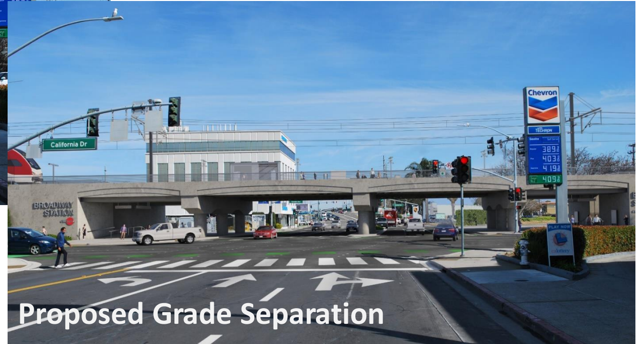
Proposed Grade Separation