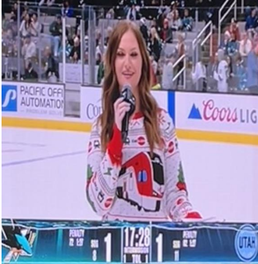
Sharks Announcer wearing Caltrain sweater