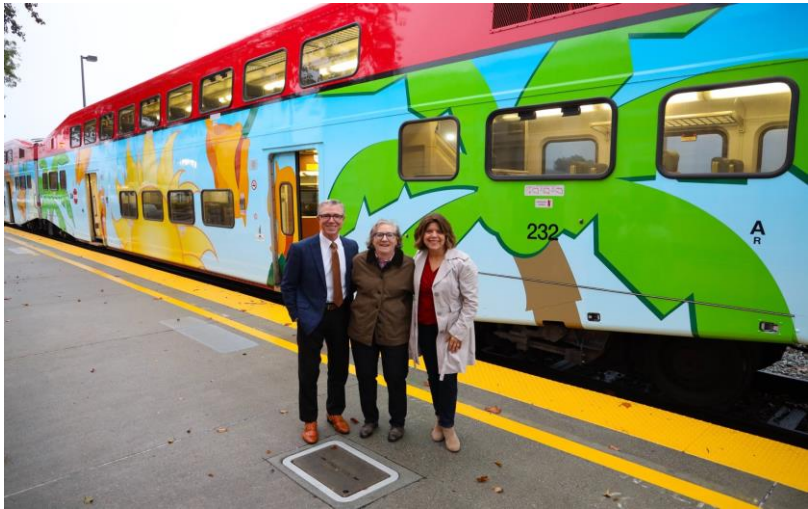
New Gilroy Service Wrapped Trains Caltrain