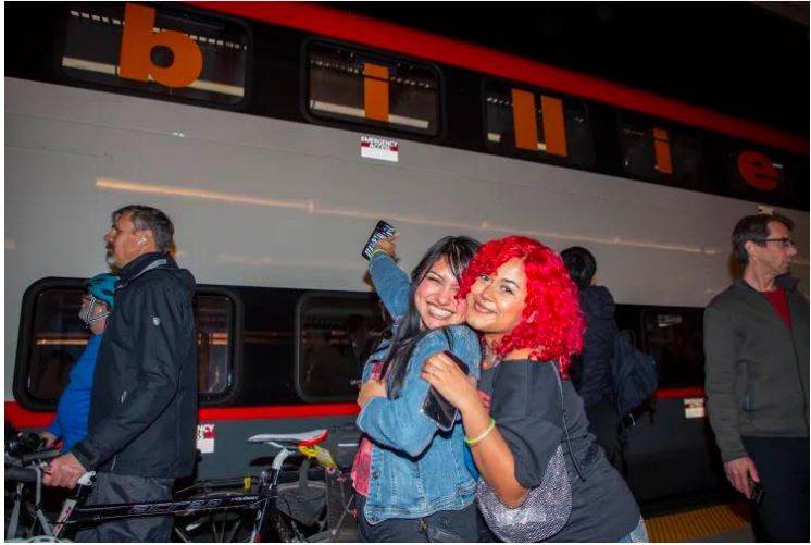
Billie Eilish Train (great press)