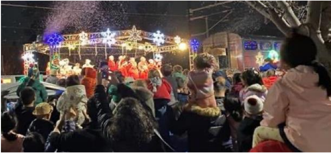
Holiday Train – 10,000+ attended, over 1,000 toys donated