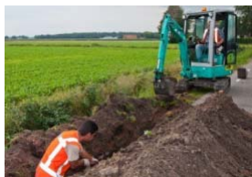
Trench w/ mini excavator