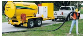
Potholing - vacuum-excavation/compressor