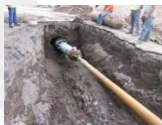
Boring Power Unit