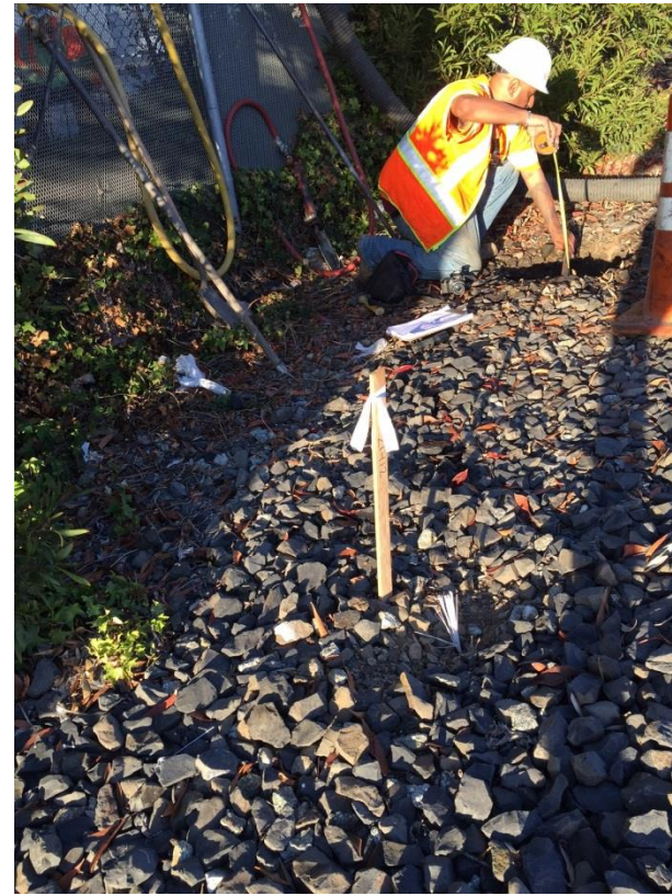
Potholing – to identify utilities