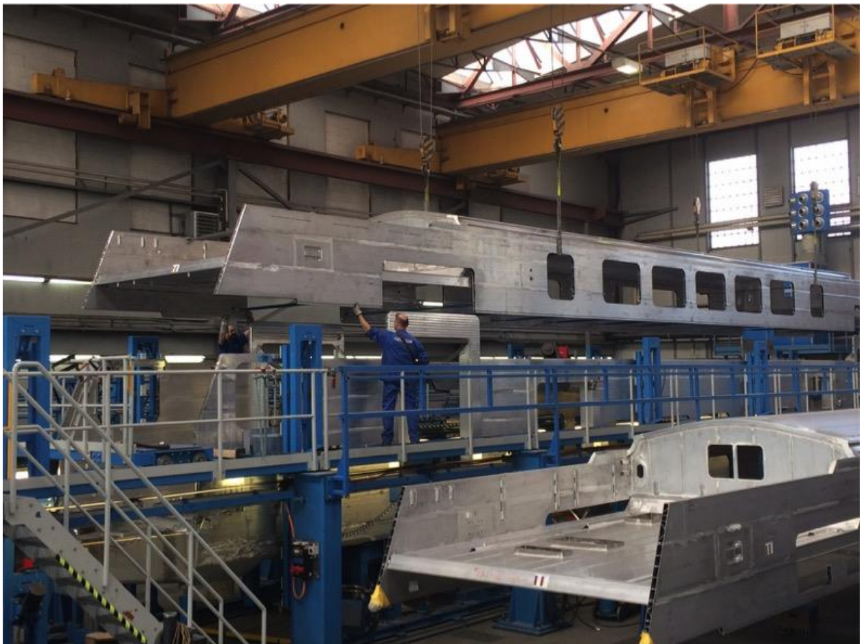
Upper and Lower Carbody Subassemblies Coming Together

View more pictures at CalMod.org/gallery .